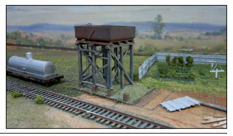
The N Gauge layout is very detailed with yet more to come. Shown here is recent progress at the branch terminus of Watsons Flat.

BANNER: Coopers Creek loop on the branch line features a station, loading bank, stock pens and stock race.