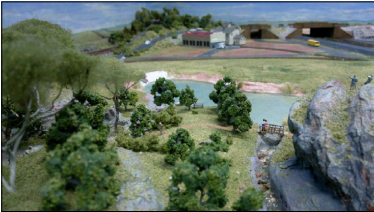
LEFT and BELOW: Some of the wonderful detail emerging on the Leafton extension.