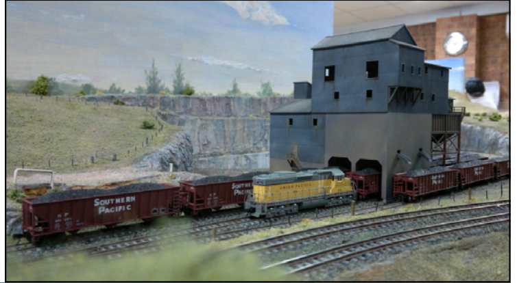
ABOVE: Shades Quarry