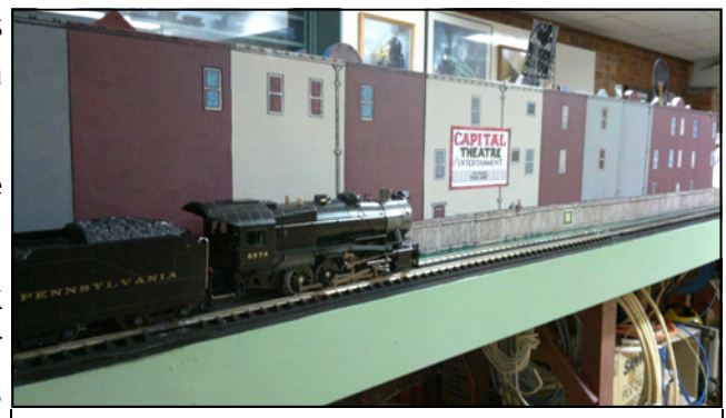
Stage 1 of the duplication runs behind the main street of Hoganvale, which required that the rear of the businesses also be modelled in low relief.

Fettlers for the new track were mainly Lance Pickering and Colin Shepherd.