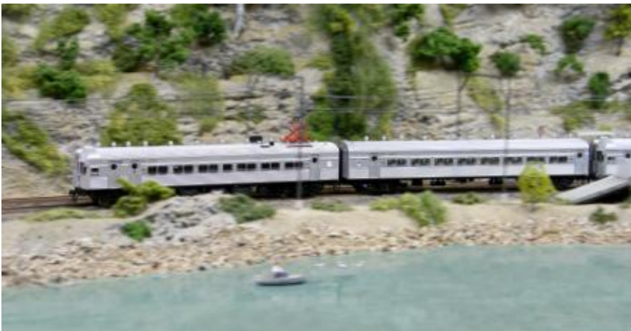
"Mullet Creek" - HO scale by Geoff Small.