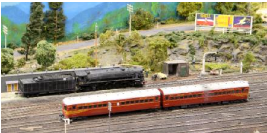
"Brisbane Waters" - HO scale by Epping Model Railway Club.