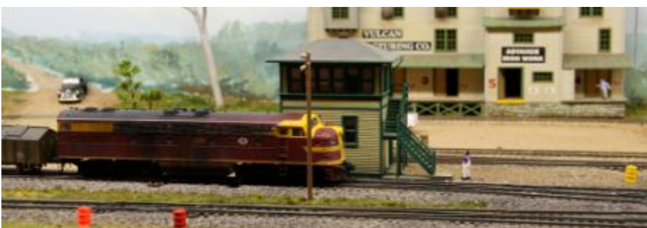
"Coffs Harbour " - HO scale by Coffs Harbour Railway Modellers.