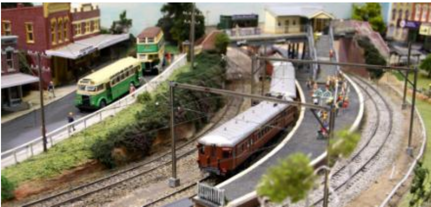
"Yendays" - HO scale.