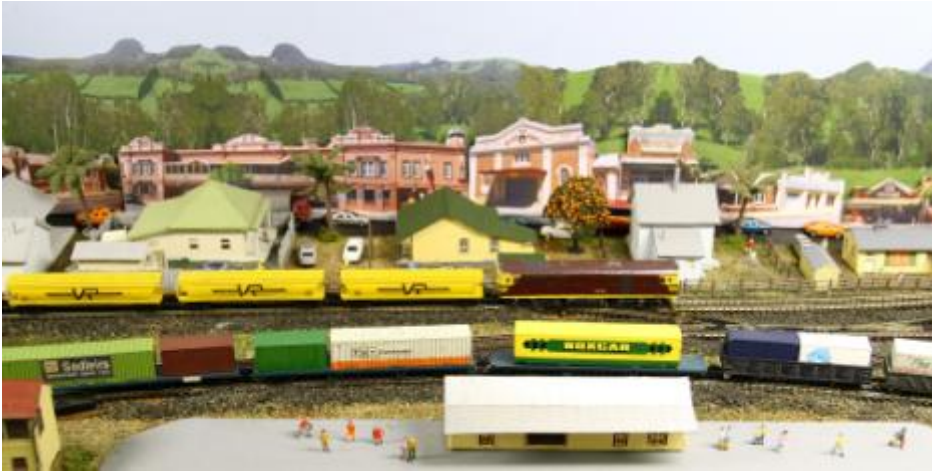
"Colcairn" - N scale by Col & Vonnay Veale.