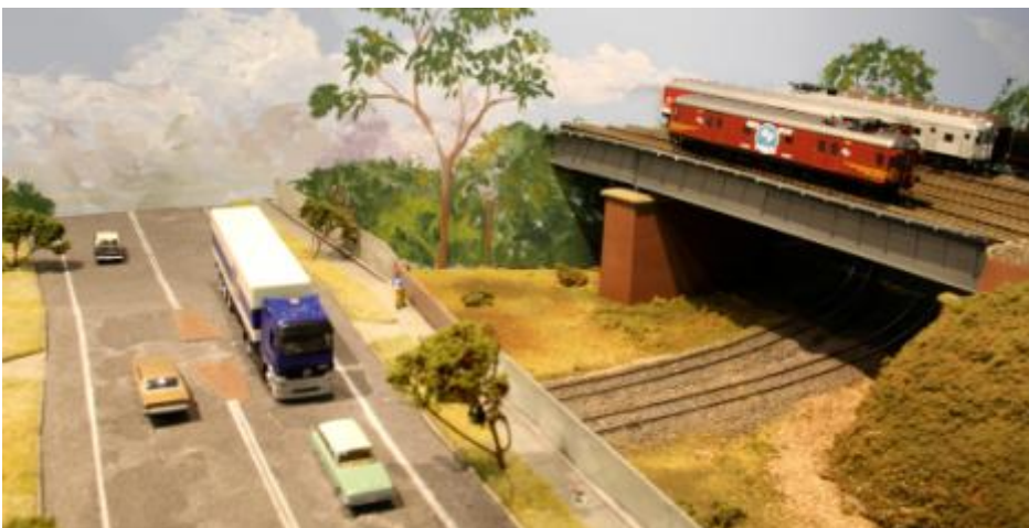
"Mungo Scott's " - HO scale by SMRS (Sydney Model Railway Society).