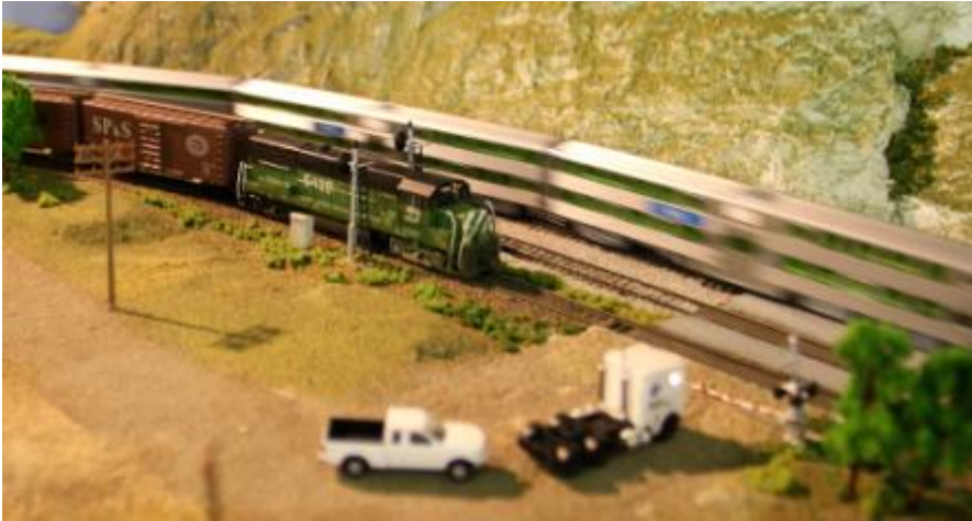
"Wishram" - N scale by Sydney N scale Model Railway Club.