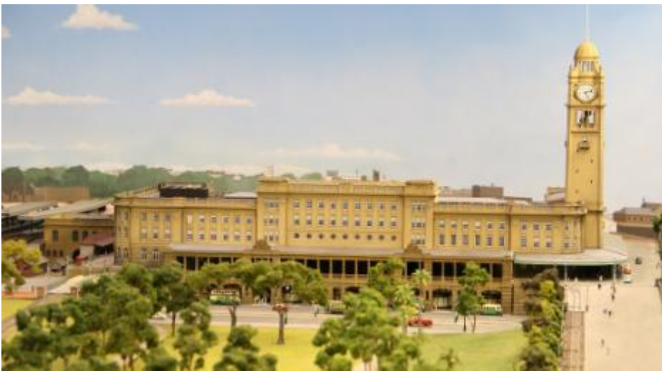
"Sydney Central Station" - N scale by Ross Balderson.