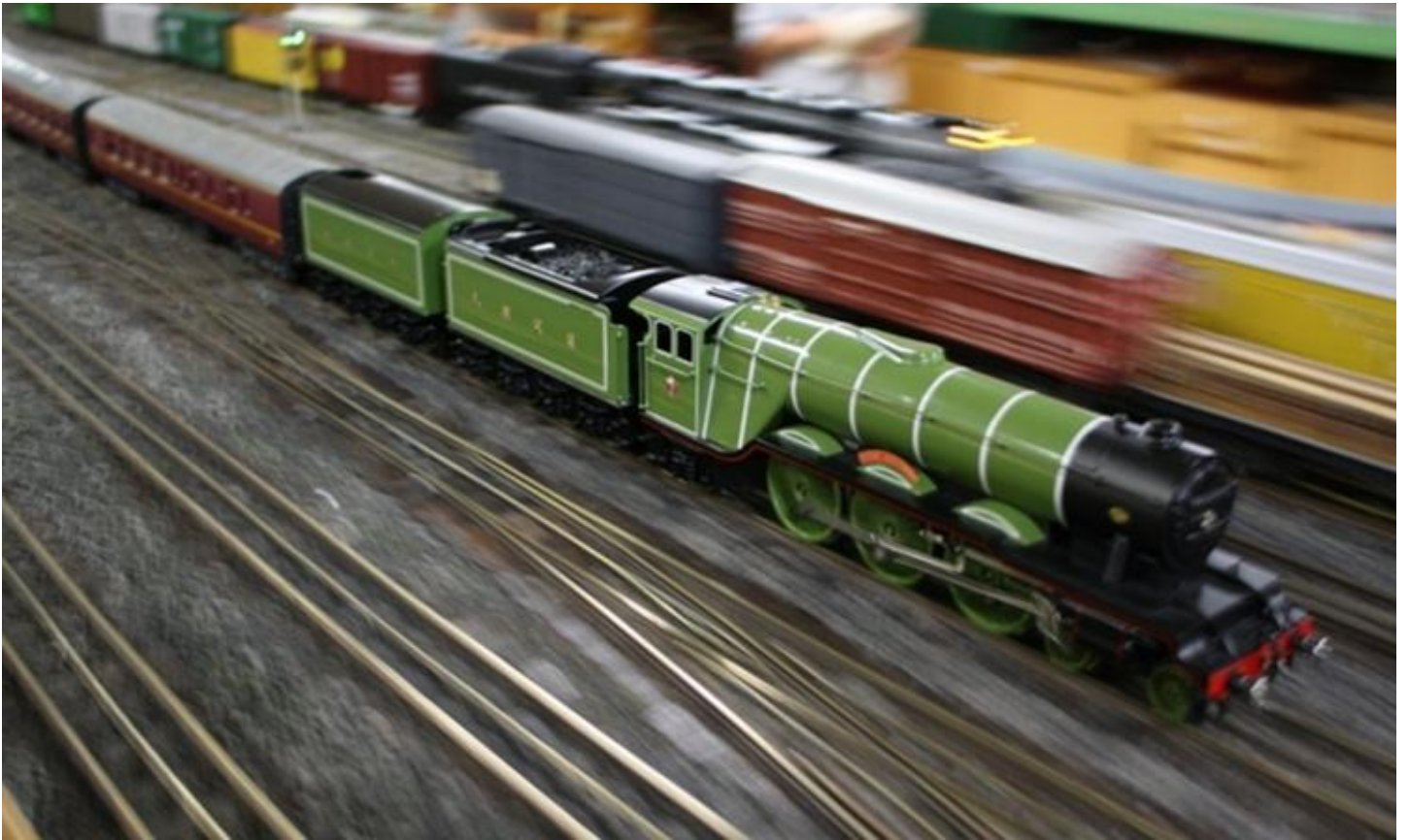
Norm Davies' loco, the Flying Scotsmen. Captured in 2011.