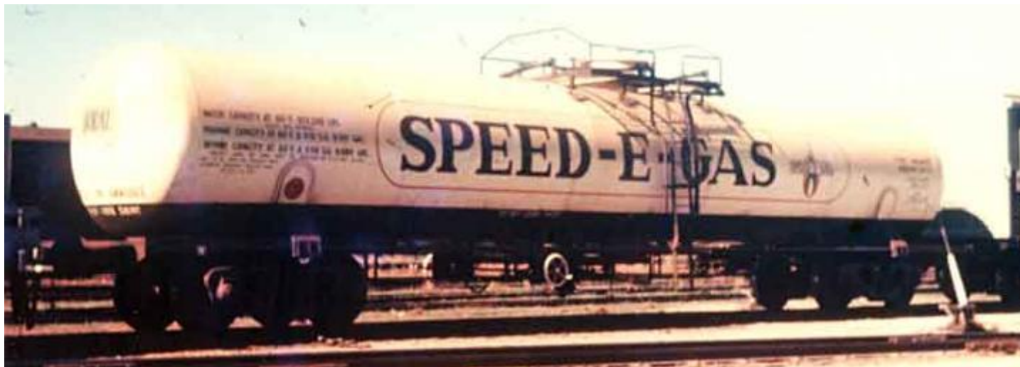
From the "Bill Blannin Collection of (mostly) QR photos".

FROM: http://qldrailheritage.com/mrqc/photos-bb3.html