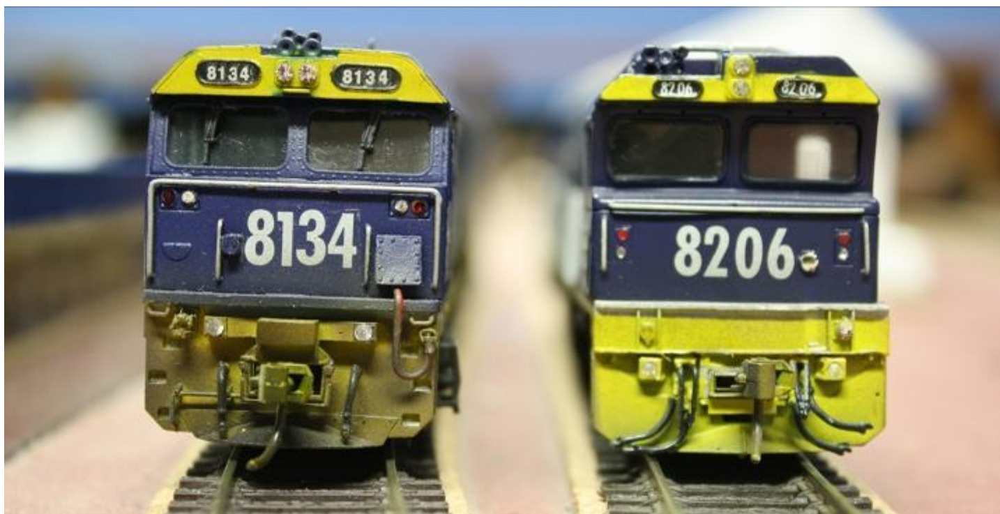
FreightCorp locos 8134 and 8206 sit in Read yard. Both locos modelled by James Percival.

The track work for the through road at Read is now complete but the wiring has to be completed. The "blocks" have to be re-measured to ensure all the train lengths are correct and signals are in the right place. Then there is the ever-present load of new feed to be run in. Control Centre only control is advanced, the basic wiring still has to be done.