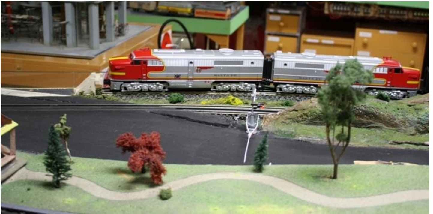
DCS controlled locos sit making noise on a busy Open Day afternoon in 2011.