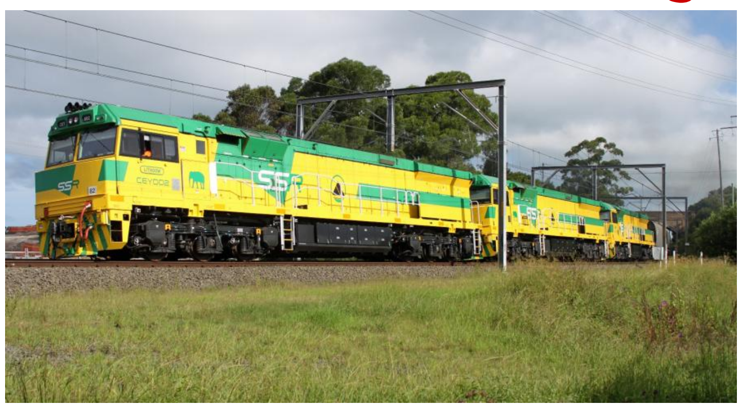
Centennial Coal's new locomotive run by SSR, the CEY class, power up at Thirroul with LS01 empty coal to Lithgow.