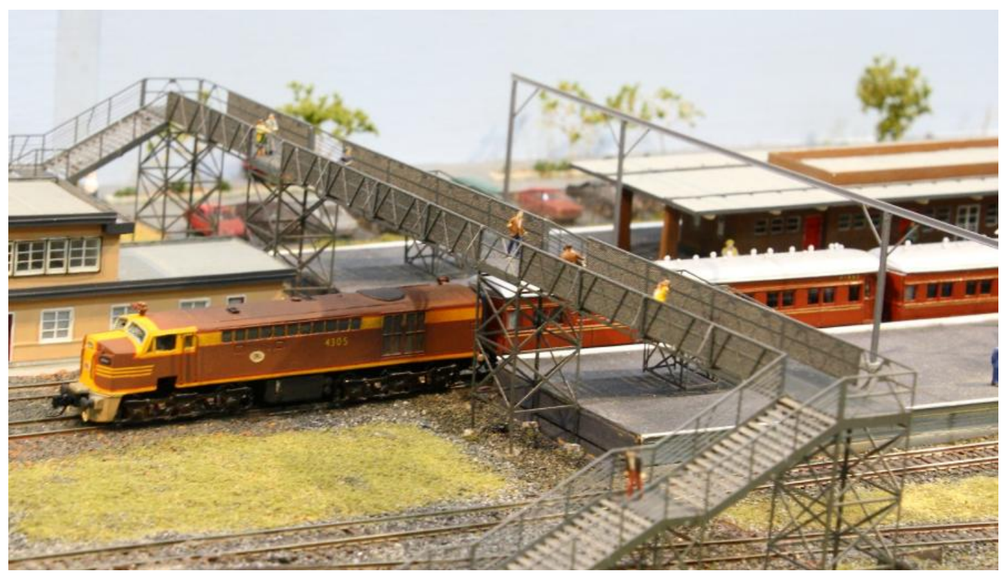
A 43 class stops at the station on the New South Wales N Scale Group's layout - "South Creek" based on Sydney outer-western suburb of St Marys.