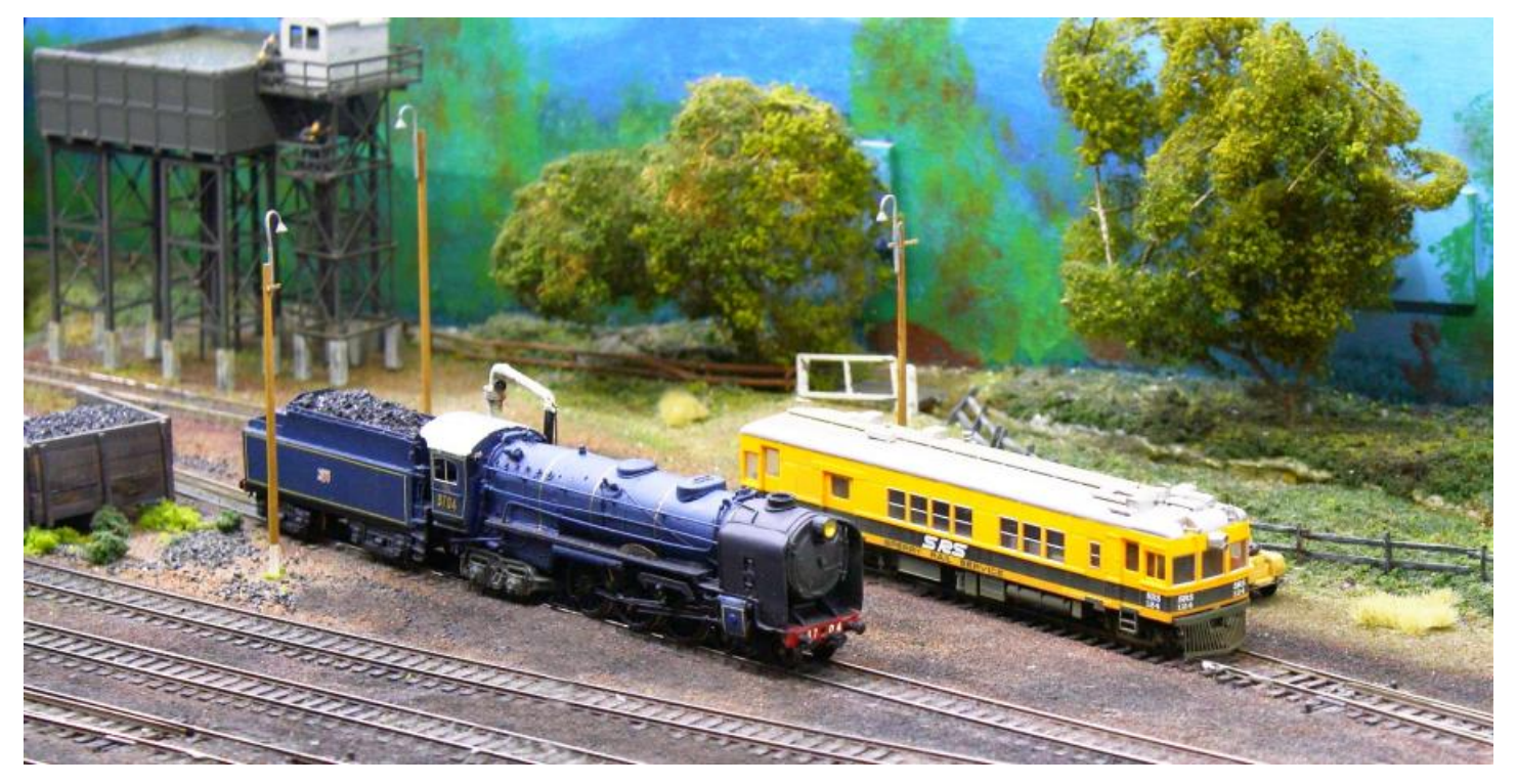
The never produced NSWGR 37 class sits on Epping Model Railway Club's layout "Brisbane Water.