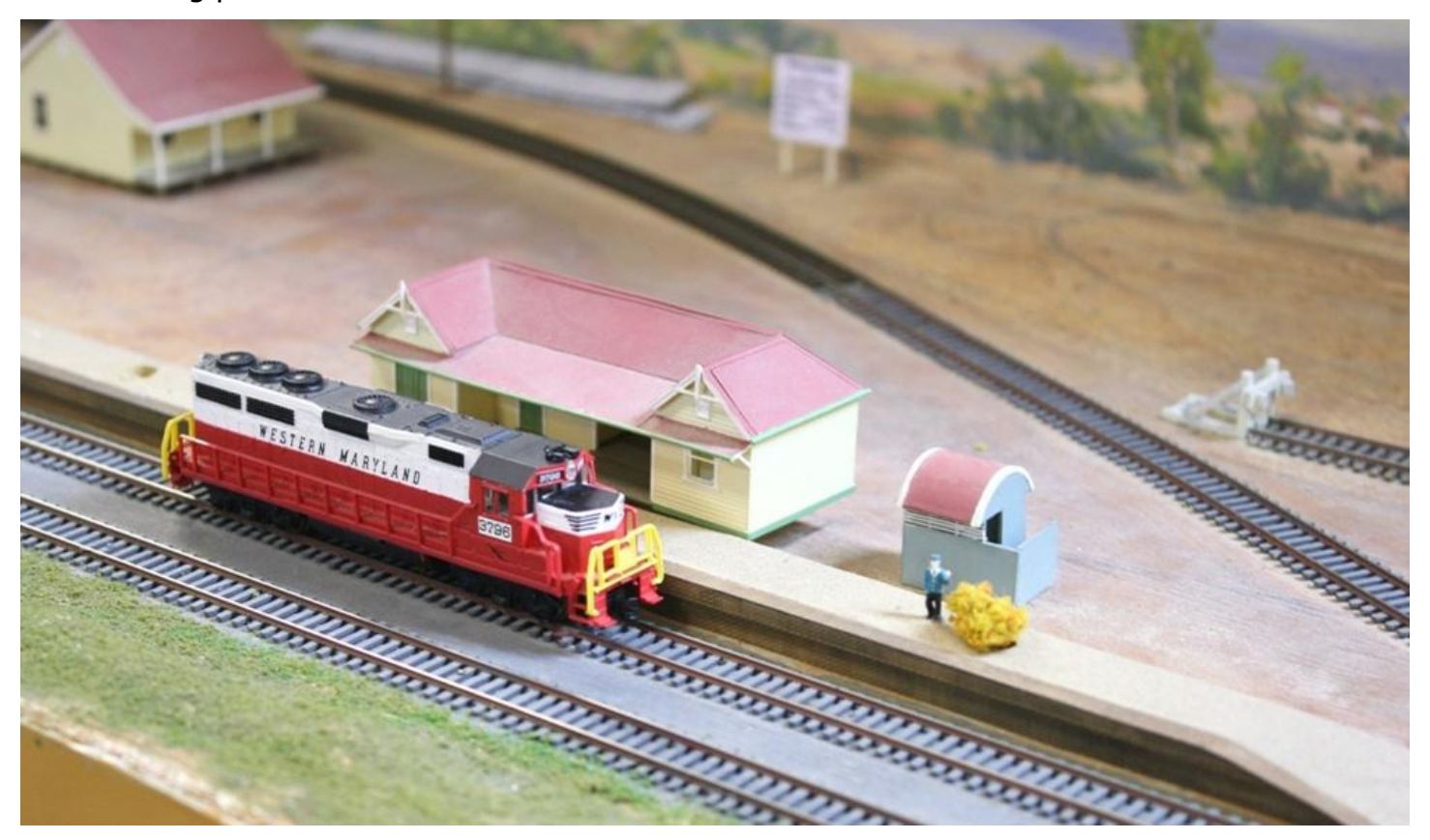
A US "Western Maryland" loco sits on the N scale layout.