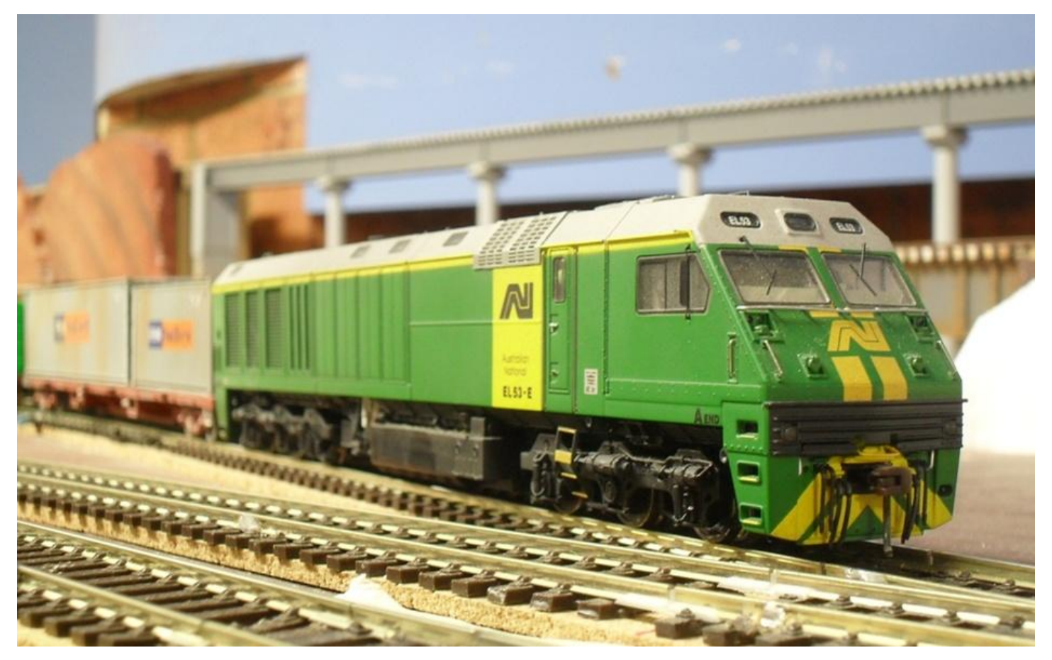
An Australian National EL class stops at DEAWY with an Intermodal freight.