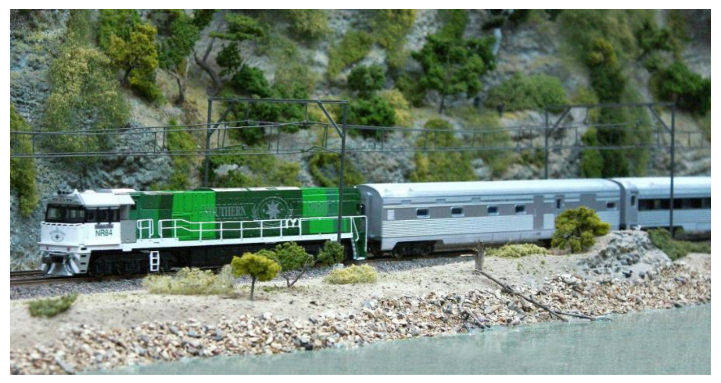
NR84 pulls the Southern Sprit through Geoff Small's layout "Mullet Creek" located near Hawkesbury River.