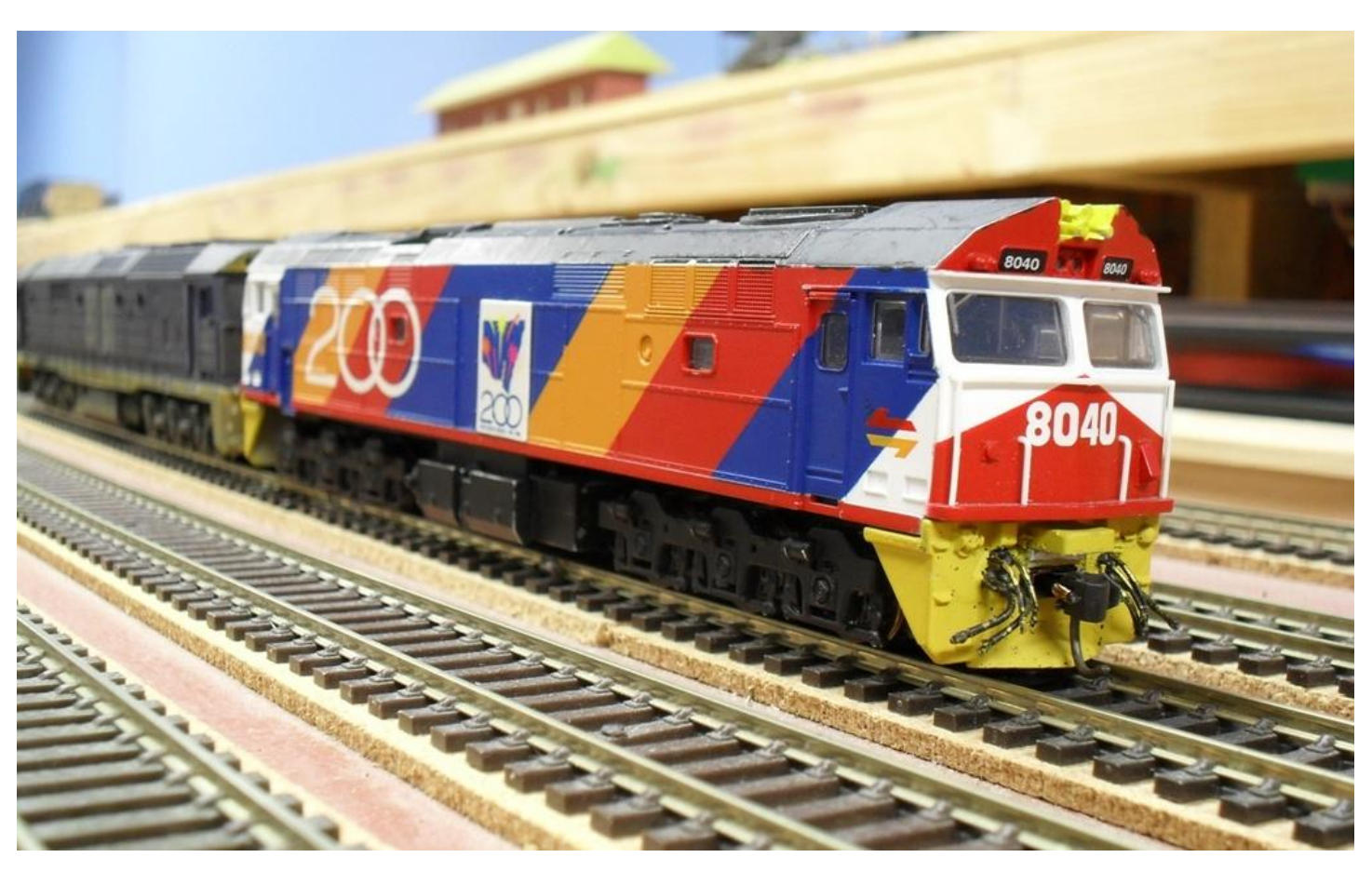
One of NSW's Bicentennial locomotives - 8040 sits on the HO layout.