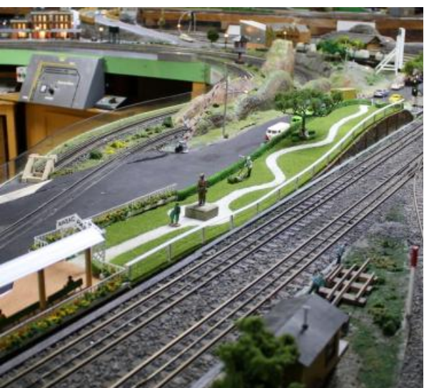
New additions to the O scale layout.