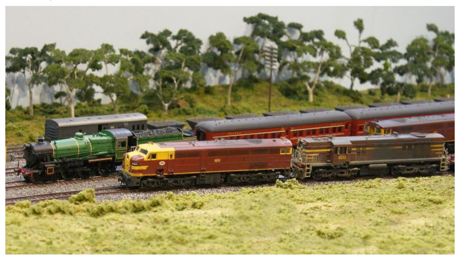
"Waterfall" by Illawarra Model Railway Association at the 48th Sydney Model Railway Exhibition.