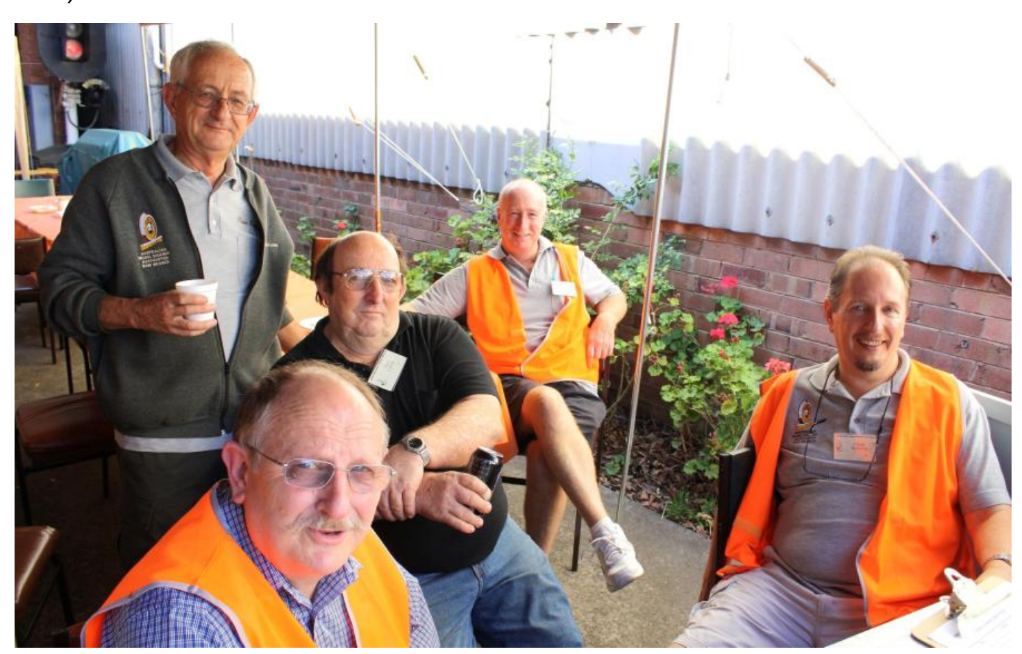
AMRA members pose for a photo during the Open Weekend.