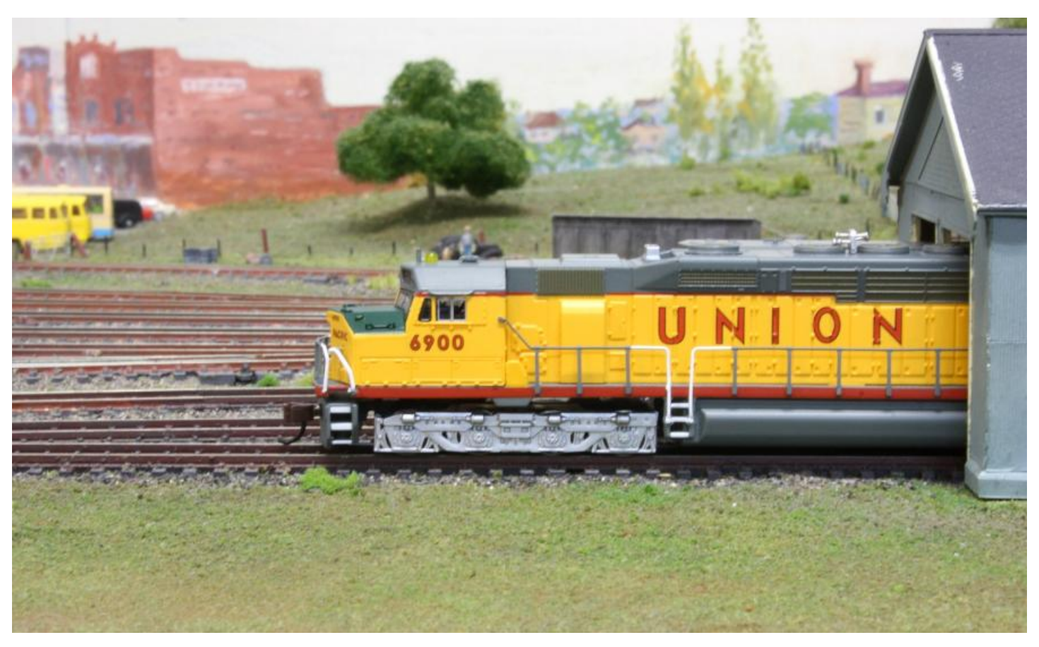
A Union Pacific 6900 loco sits in the shed on the N scale layout.