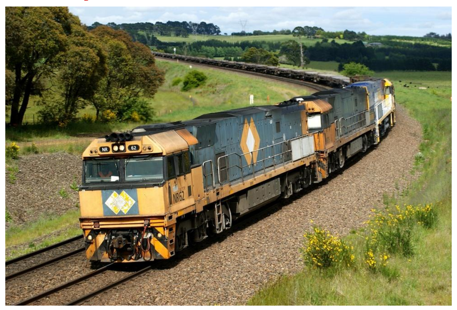
NR62 in "Vanilla" with diamonds