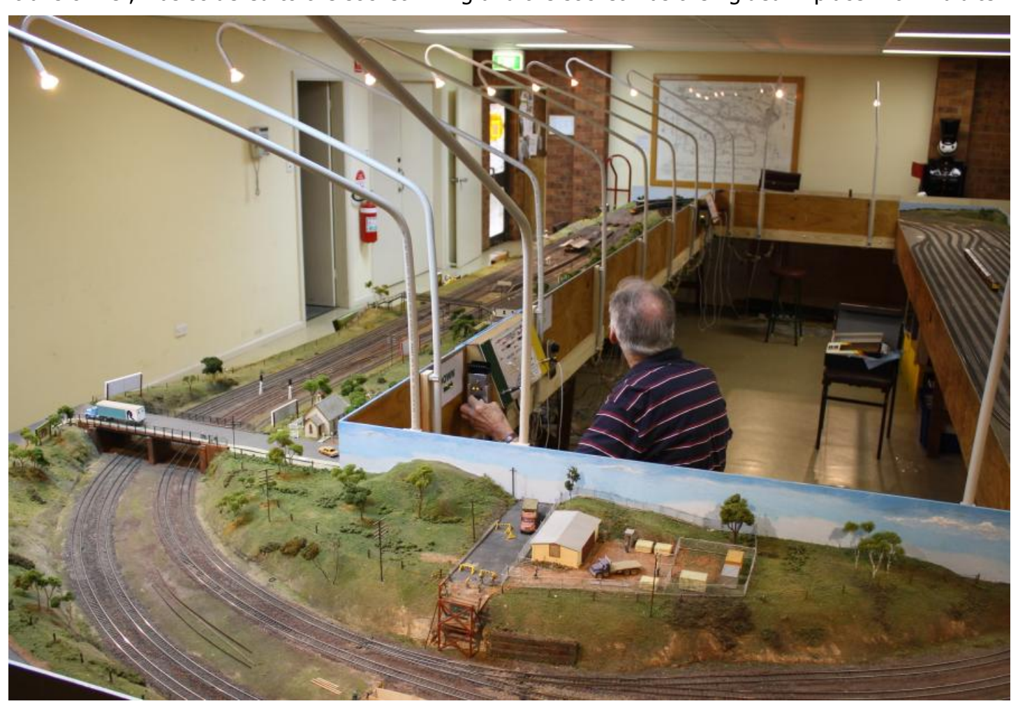
Graeme Shade works "East Matelend" on a quite Wednesday morning. Note the new lighting and its overall effect on the layout.

It was calculated that thirteen lights were required to give a good coverage to "East Matelend". The conduit was purchased and cut to length and then Marilyn and I bent each piece to shape on a bending jig made of a length of MDF, a 4 litre paint can and a tuna can. The bends were achieved using a heat gun and a conduit bending spring. Once the conduit was bent the gooseneck end was counterbored to receive the downlight socket. A length of figure 8 cable, long enough to reach the transformer, was soldered to the socket wiring and the socket was then glued in place with Araldite.