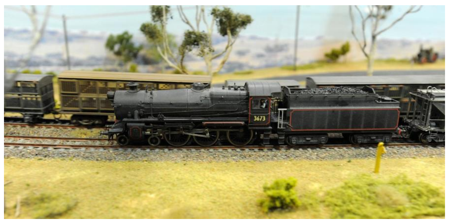
A NSWGR 36 class 3673 speeds a wheat train through Geoff Smalls, layout "Odd Walls" based on the Main South line in the 1980s.