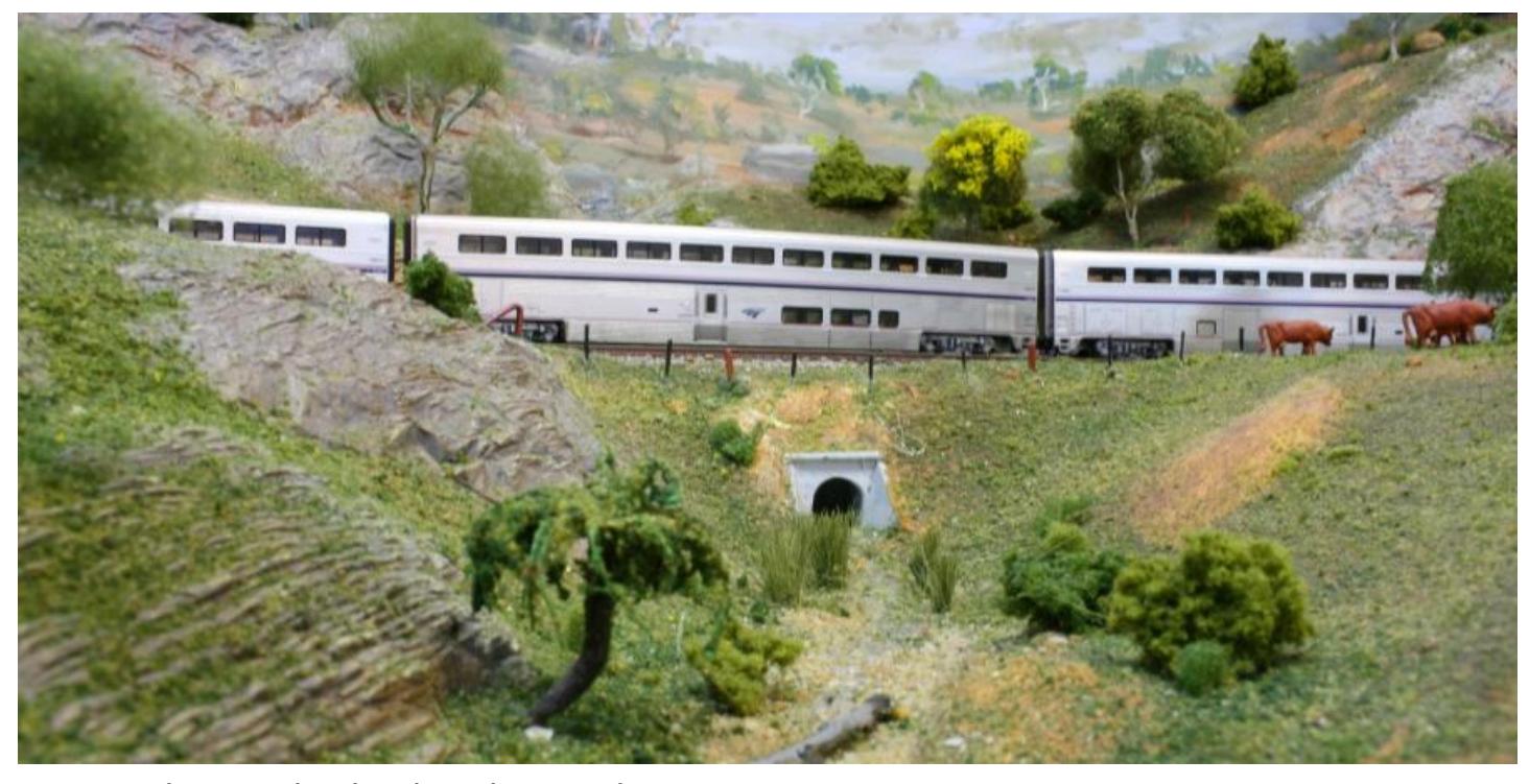
A scene showing the detail on the N scales Layout.