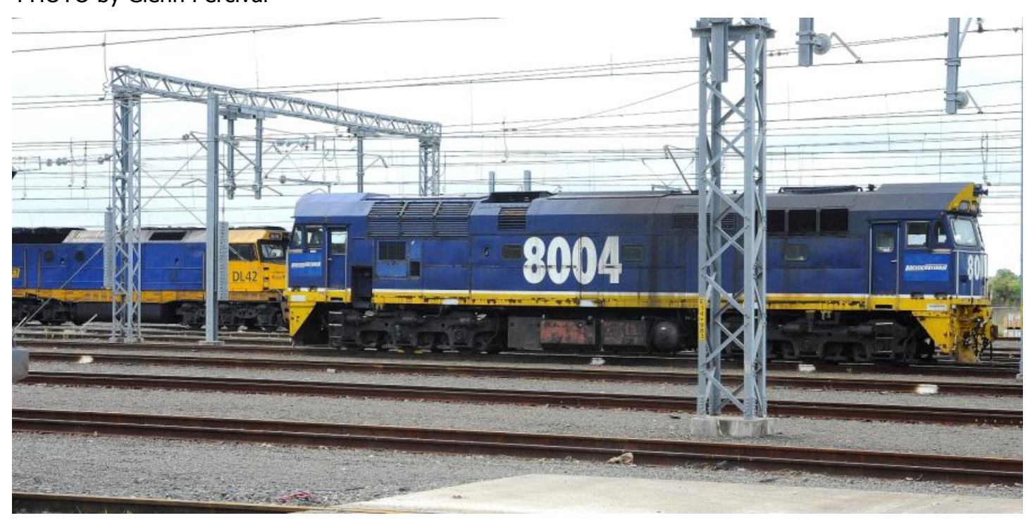
Pacific National's 8004 and DL42 sit in Enfield yard, waiting for their next task.