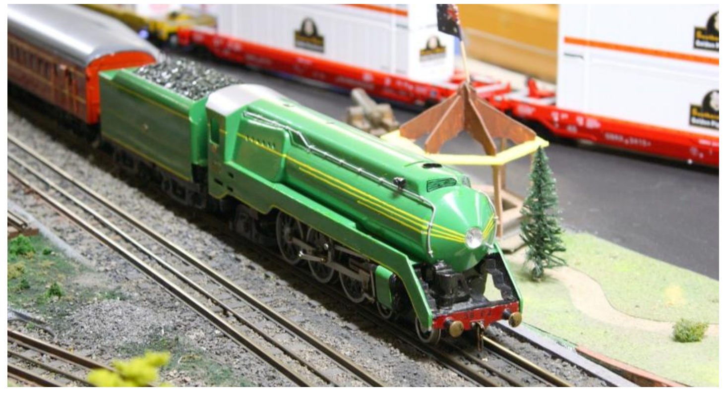
NSWGR's 3802 speeds through Hoganvale on the O scale layout.