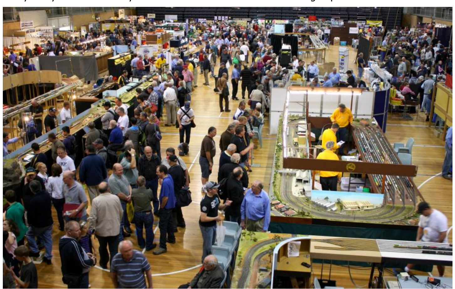
The early Saturday morning crowd viewing the exhibition.