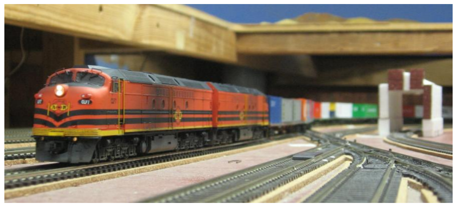
CLF7 leads a QRN intermodal container freight to a stop shy of Read platform #1.