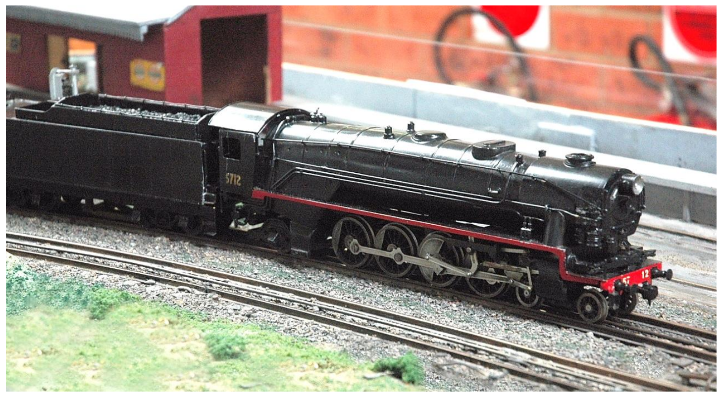
5712, a member of the NSWGR D57 class, stands on the O scale layout