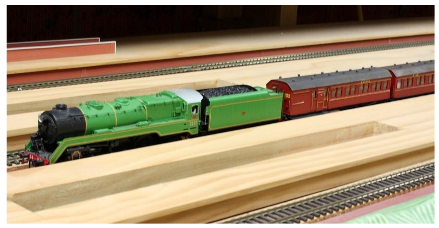
Rod Fussell's NSWGR 38 class stops at Read platform 2 to unload passengers.

I'm sure there will be many more cables to be run but as far as the main running line is concerned, 95% of the cables have been run.