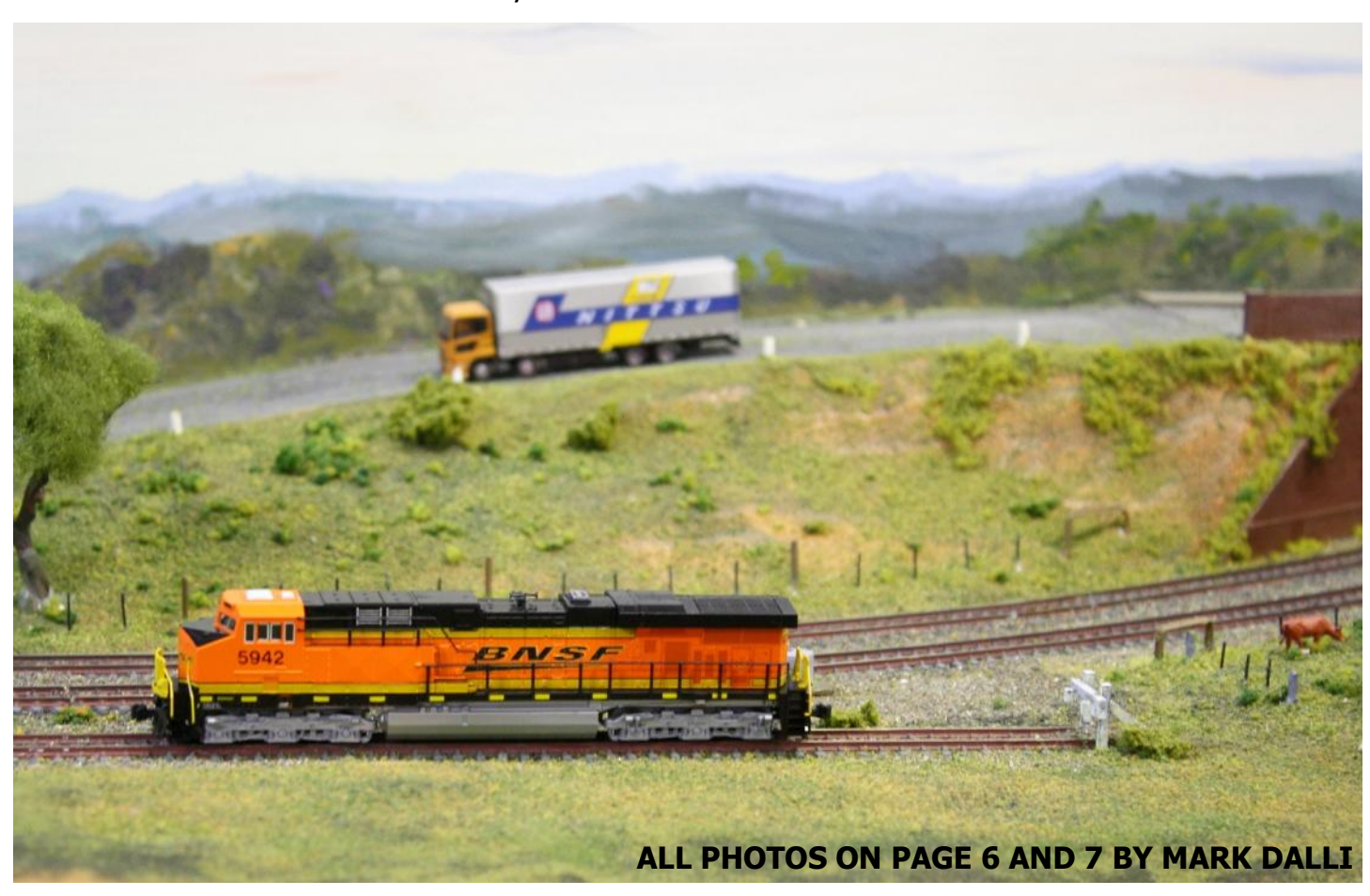
BNSF's 5942 stands on the N scale layout