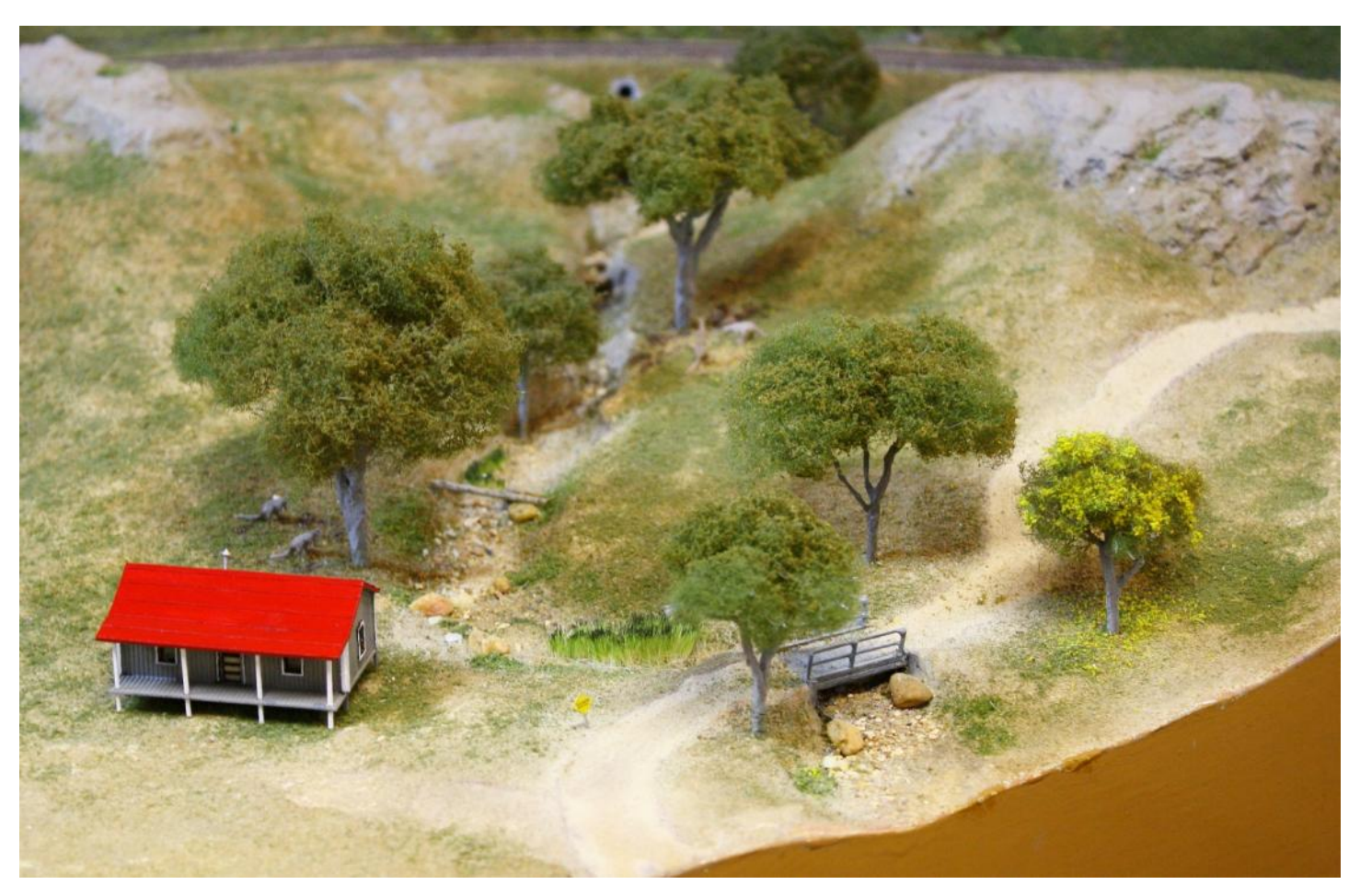
Wow, how real does this look! All the work is paying off; this section is located off the branch line on the N scale layout.