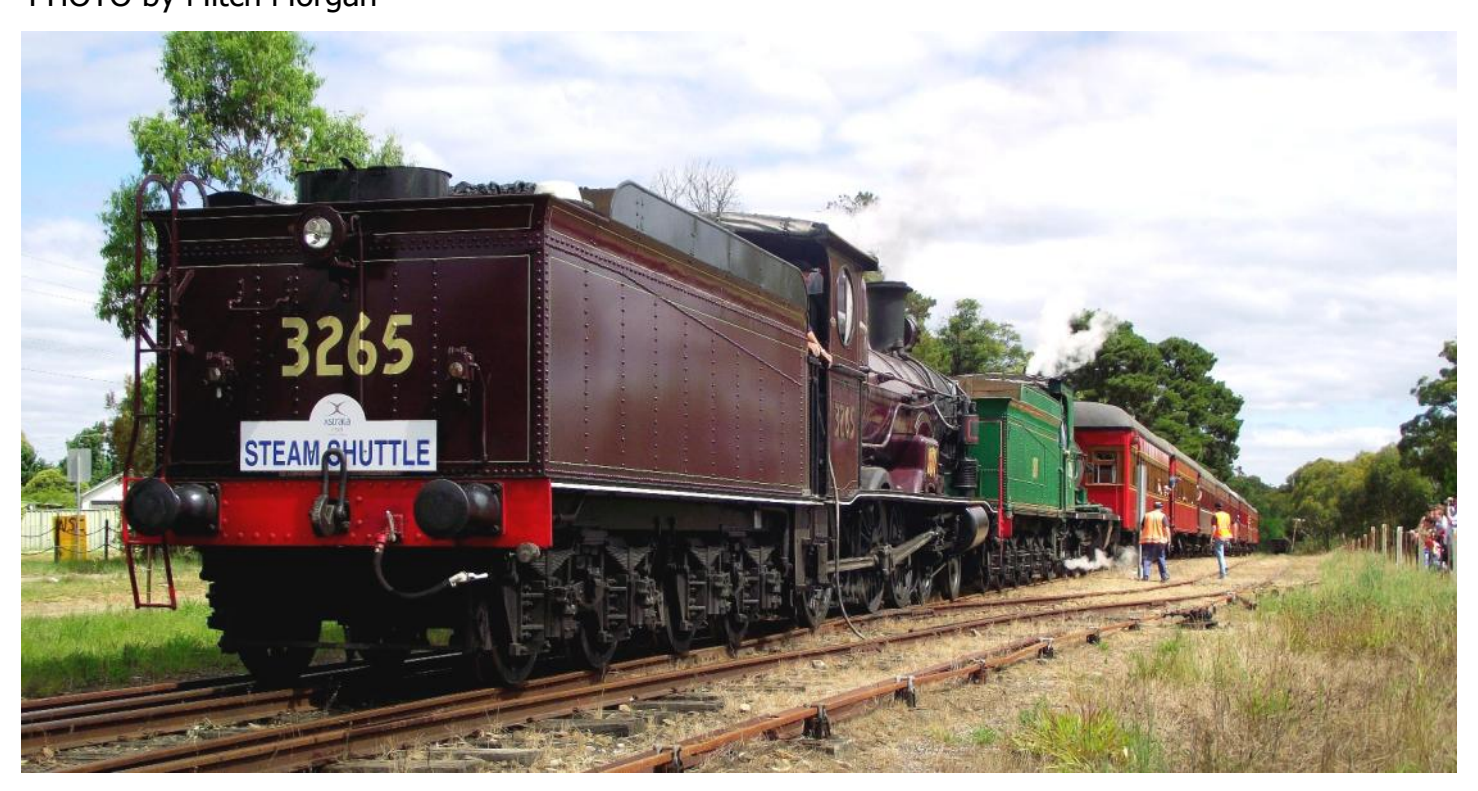
Powerhouse's 3265 and RTM's 2705 finish running around their train at Buxton, photo taken at the 2011 Thirlmere festival of steam.