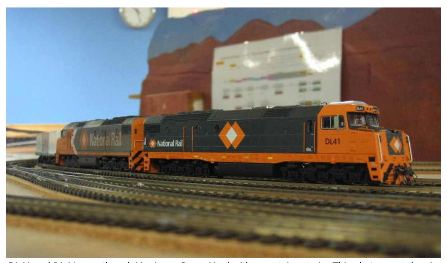
DL41 and DL44 pass though Yerriyong Down Yard with a container train. This photo was taken in 2009. The train is owned by Ben Gilmore.