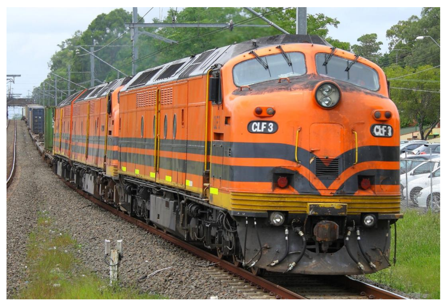
CLF3 powers through Panania with 4MB7. Triple CLP's and CLF's were used on Brisbane to Melbourne and Melbourne to Brisbane intermodal services during January 2011.