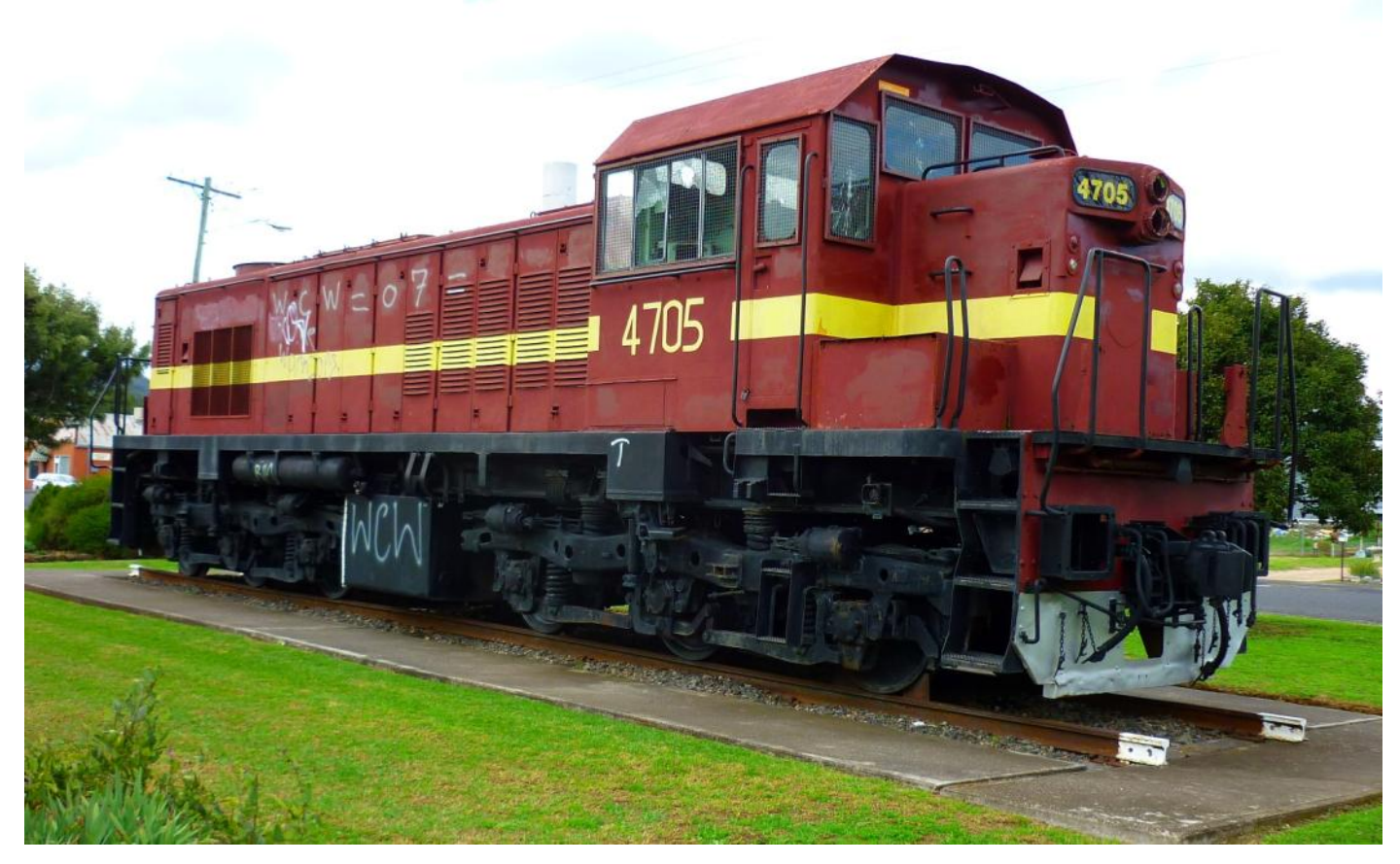
4705 sits at a public viewing spot in Werris Creek.