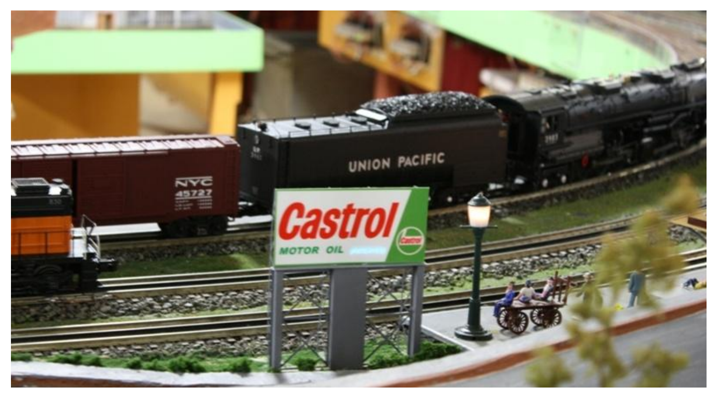
A new feature on the O scale layout is a flashing Castrol billboard, there is also a "Hobbies Are Us" billboard which also flashes and changes colour.