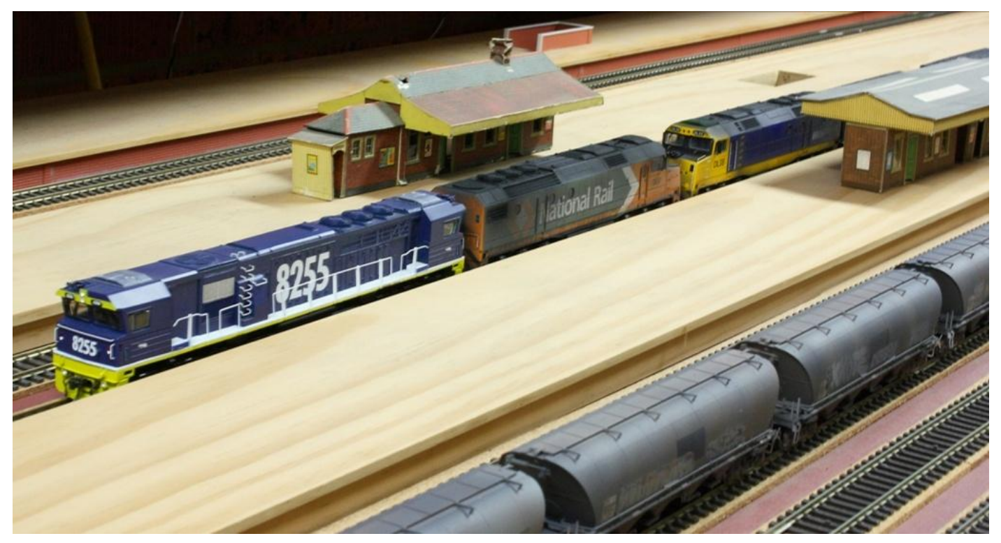
A very prototypical southern coal lineup, as seen here at Read platform 2 with 8255, DL44 and DL38.