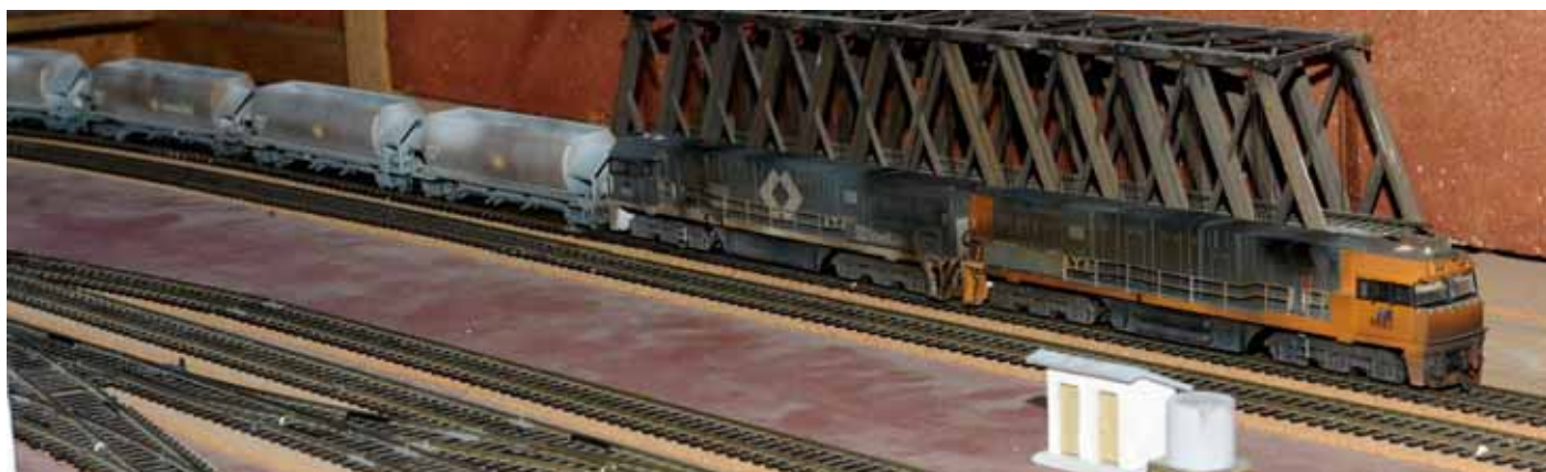
James Percival at his best with his highly prototypical trains with an example of a modern day limestone train led by NR82.