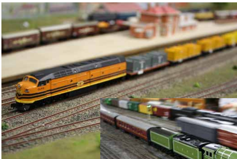
CLP13 with a rake of steel wagons sits on the N scale layout.