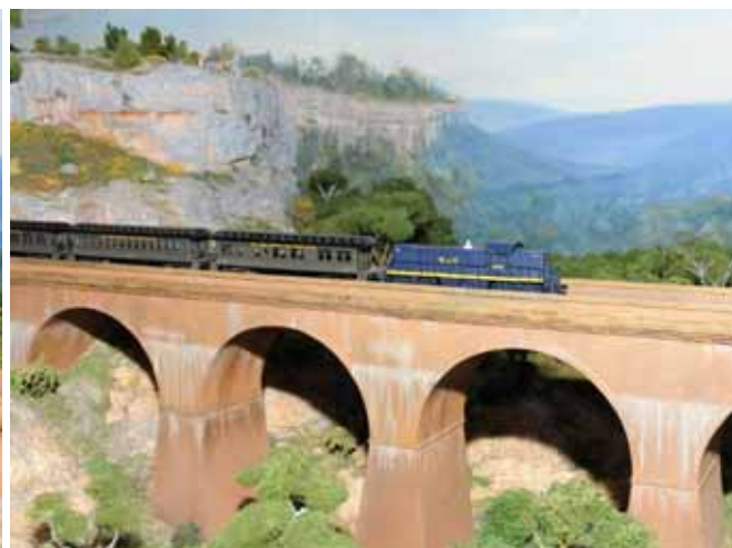
A B and O locomotive (9185) is travelling over the viaduct on the N scale layout.