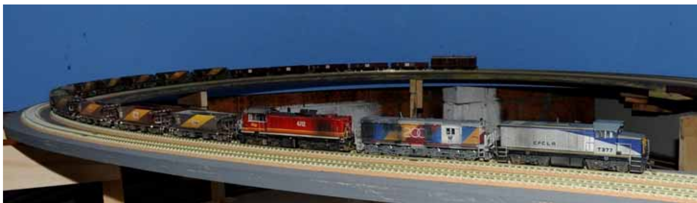
T377 leads a 48 and a 47 class with a ballast train which is sitting in Brewers Creek on the inside loop. This train is awaiting instructions to depart to the Down Main on the Stoney Creek HO layout.