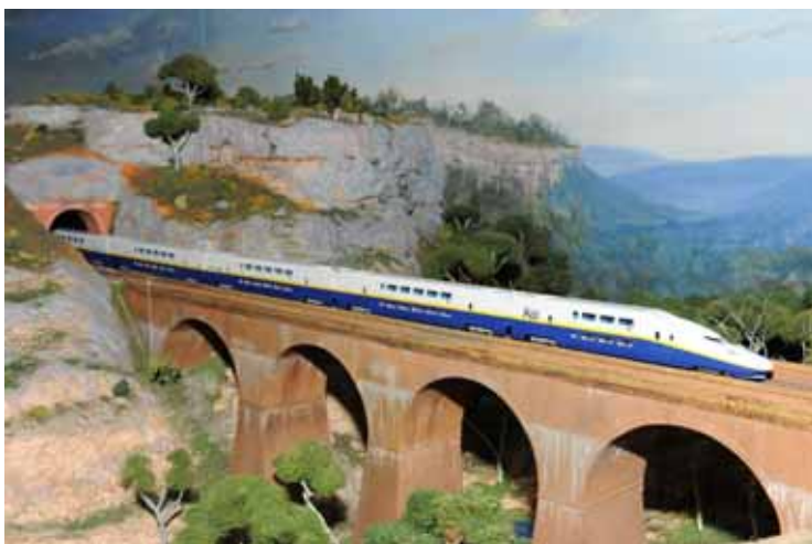
A Max Bullet train (Japan) speeds over the viaduct on the N scale layout.