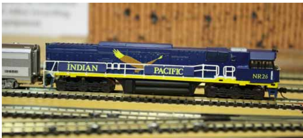
NR26 in Indian Pacific livery stands in the yard on the N scale layout.