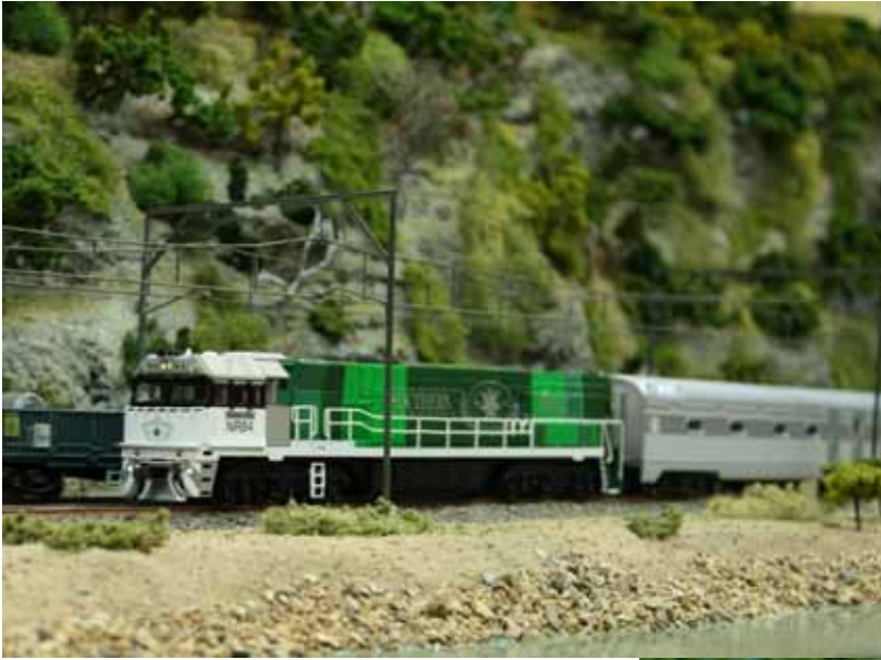
Geoff Small's layout, Mullet Creek. NR84 with the Southern Spirit travelling along the main line.

NR52 travels along Tarana. This layout is owned by the Georges River Model Railway Club.