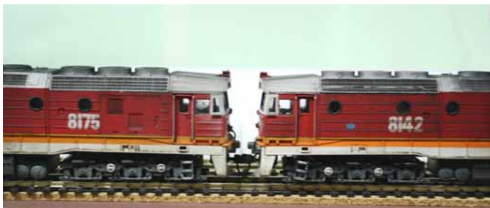
A nicely weathered pair of 81 class locos (8175 and 8142) stand in Deawy yard on the HO scale layout.