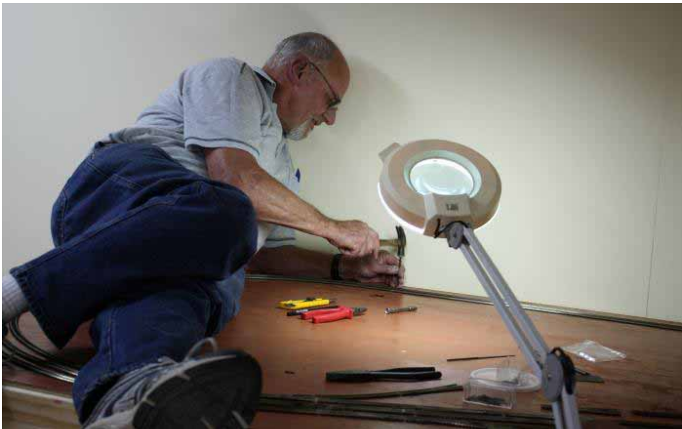
Ash lays track on the new extension to the N scale layout.

David Bennett N Scale Layout Coordinator