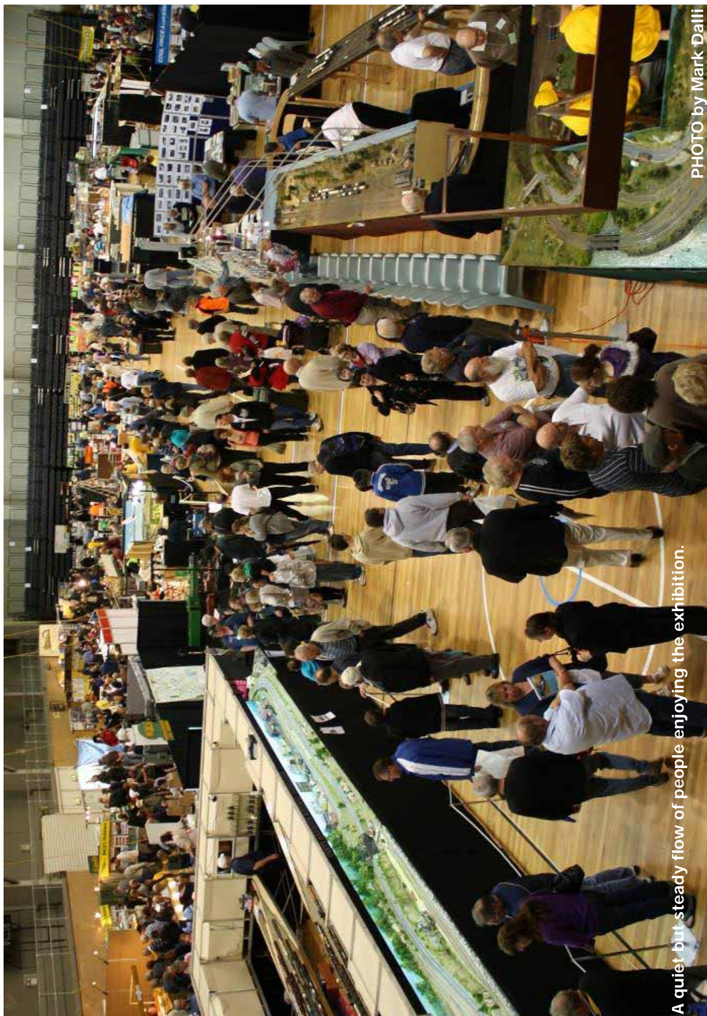
A quiet but steady flow of people enjoying the exhibition.