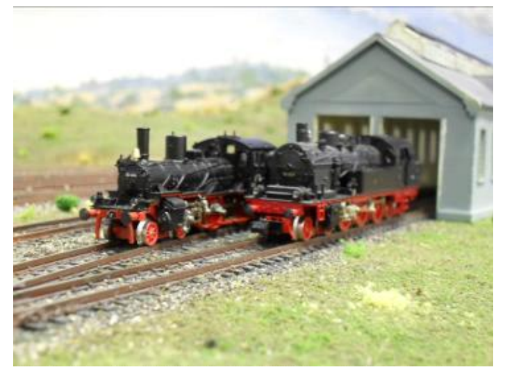
RIGHT - 8222 having a rest on AMRA's HO scale layout.