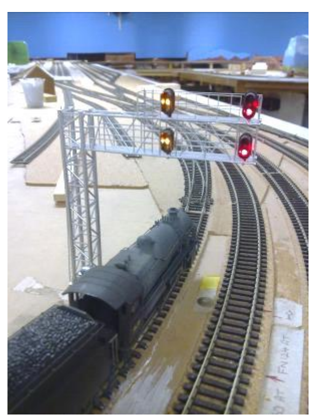
ABOVE: A NSWGR goods train approaches the Fayenton Up Loop signal, on AMRA's Stoney Creek layout.