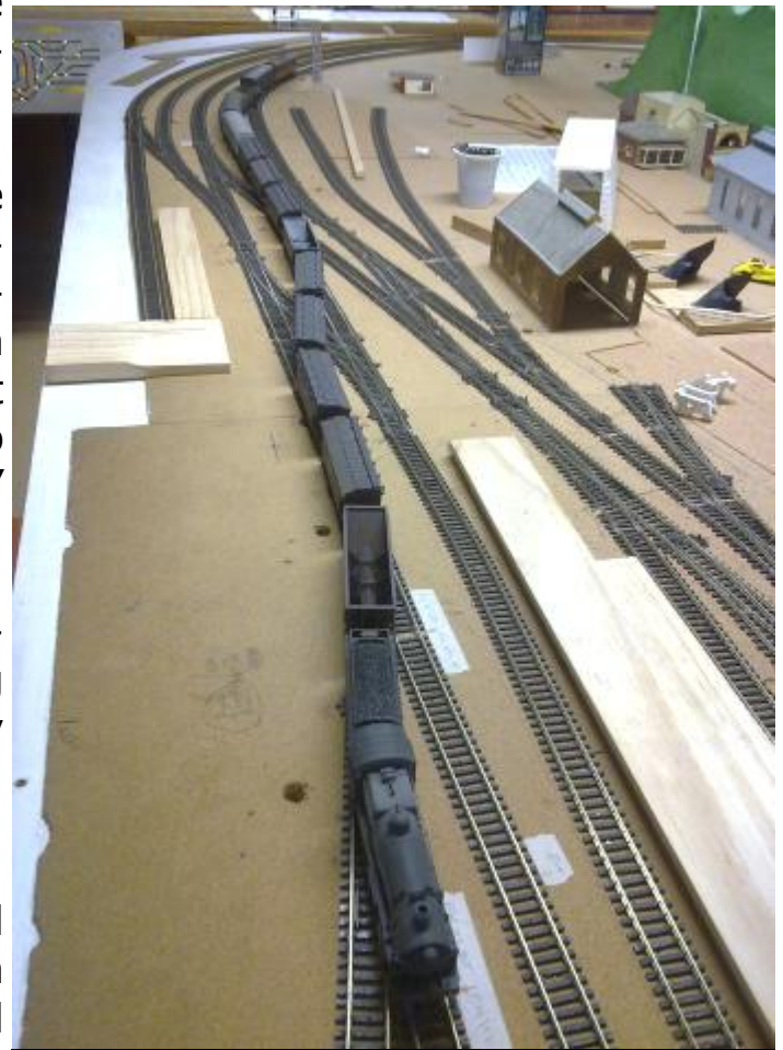
A goods train travelling along in Fayenton on the up loop

The work on Deawy is progressing well. Graham has made the Dewey relay panel a prime example of what will come. On Saturday the 6<sup>th</sup> of March 2010 a small group brought roads 1 – 4 in the down yard on line for use on the open weekend. By the time this goes to print the up yard and turn back will have the same treatment.