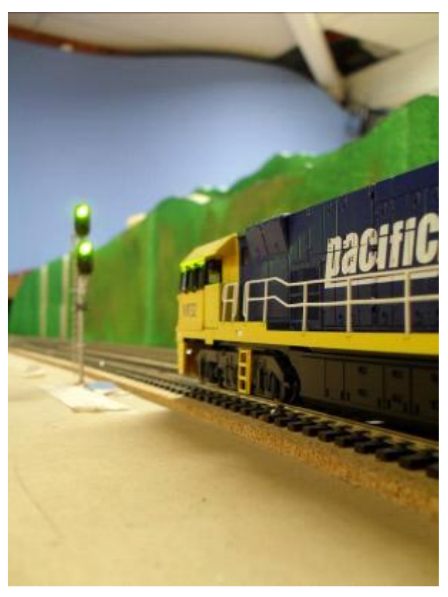
ABOVE: NR32 in Pacific National livery with a light loco at Deawy Junction with a clear run on to Down Main, on AMRA's Stoney Creek layout.