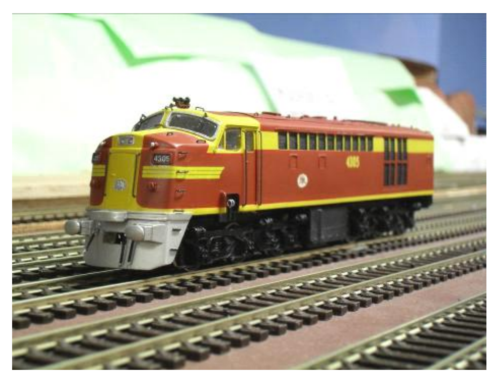
ABOVE: 4305 is the first loco to run in the 4 temporary set up roads in Deawy yard on AMRA's Stoney Creek layout.