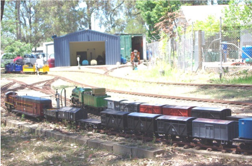
Left: Another view showing the variety of rolling stock that was also on hand