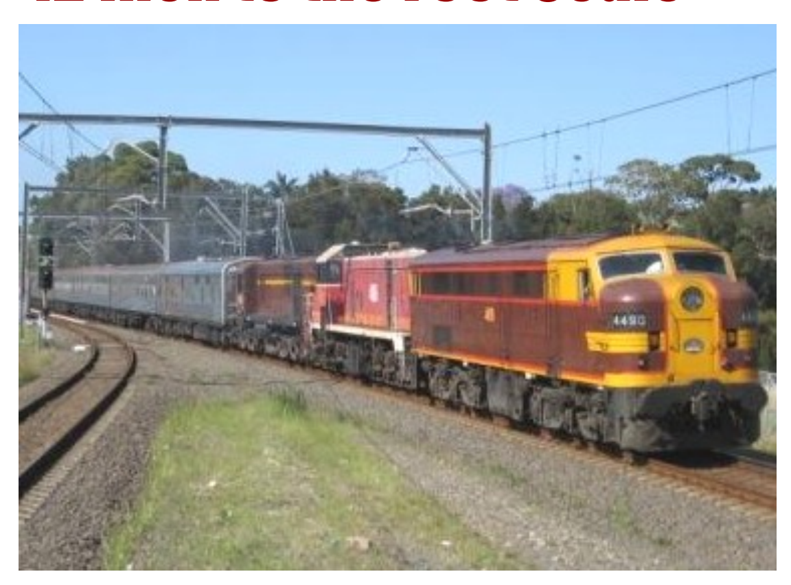
Above :4490, 4916 and 4520 lead the 2009 RTM Melbourne Cup Aurora through Wolli Creek on its way to Melbourne in November 2009