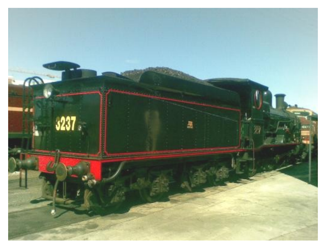
Power house Museums 3265 and Lachlan Valley Railways 3237 at Eveleigh in September 2009