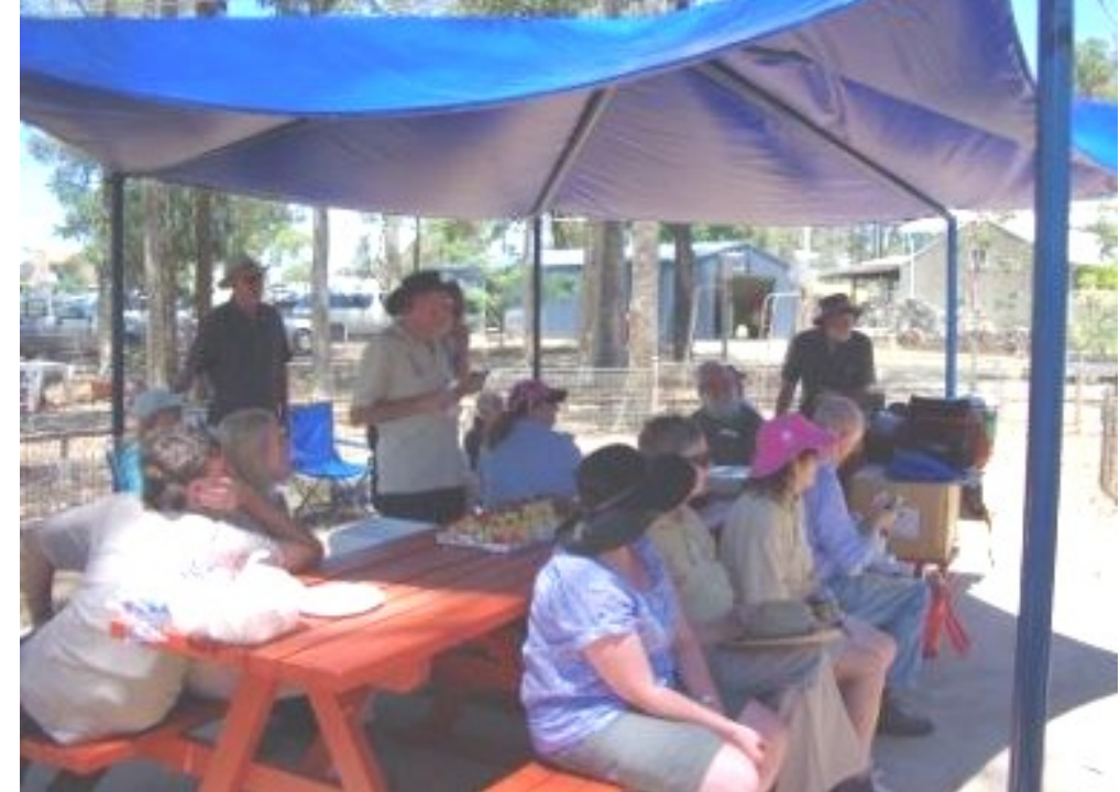
Mortdale Matters - January 2010

Right: AMRA members enjoying the shade at the Christmas function at Western District Live Steam facility at Fairfield