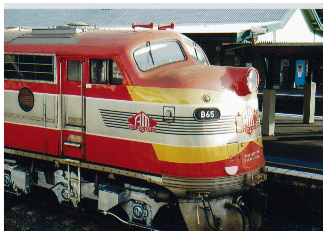
Left:B65 in Auscision colours at Lindfield station during track refurbishment work