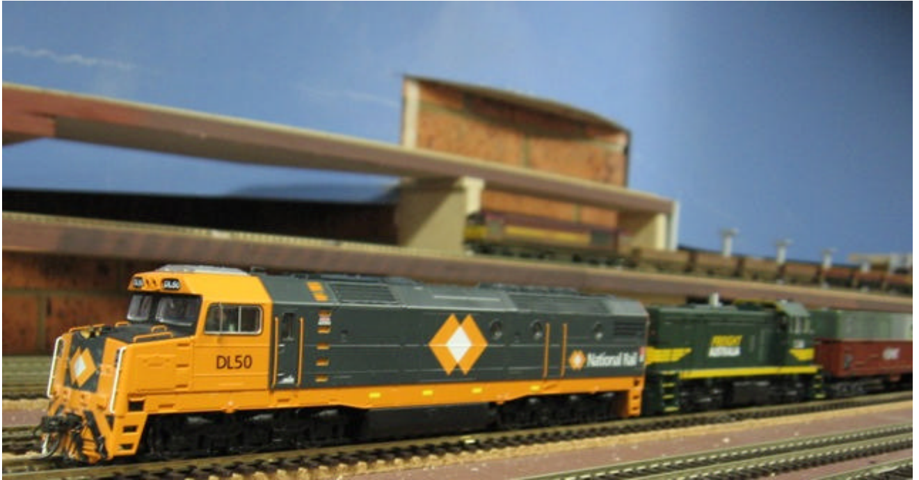
DL50 and T388 with a freight train slowly approach Deawy on the AMRA HO Stoney Creek layout.