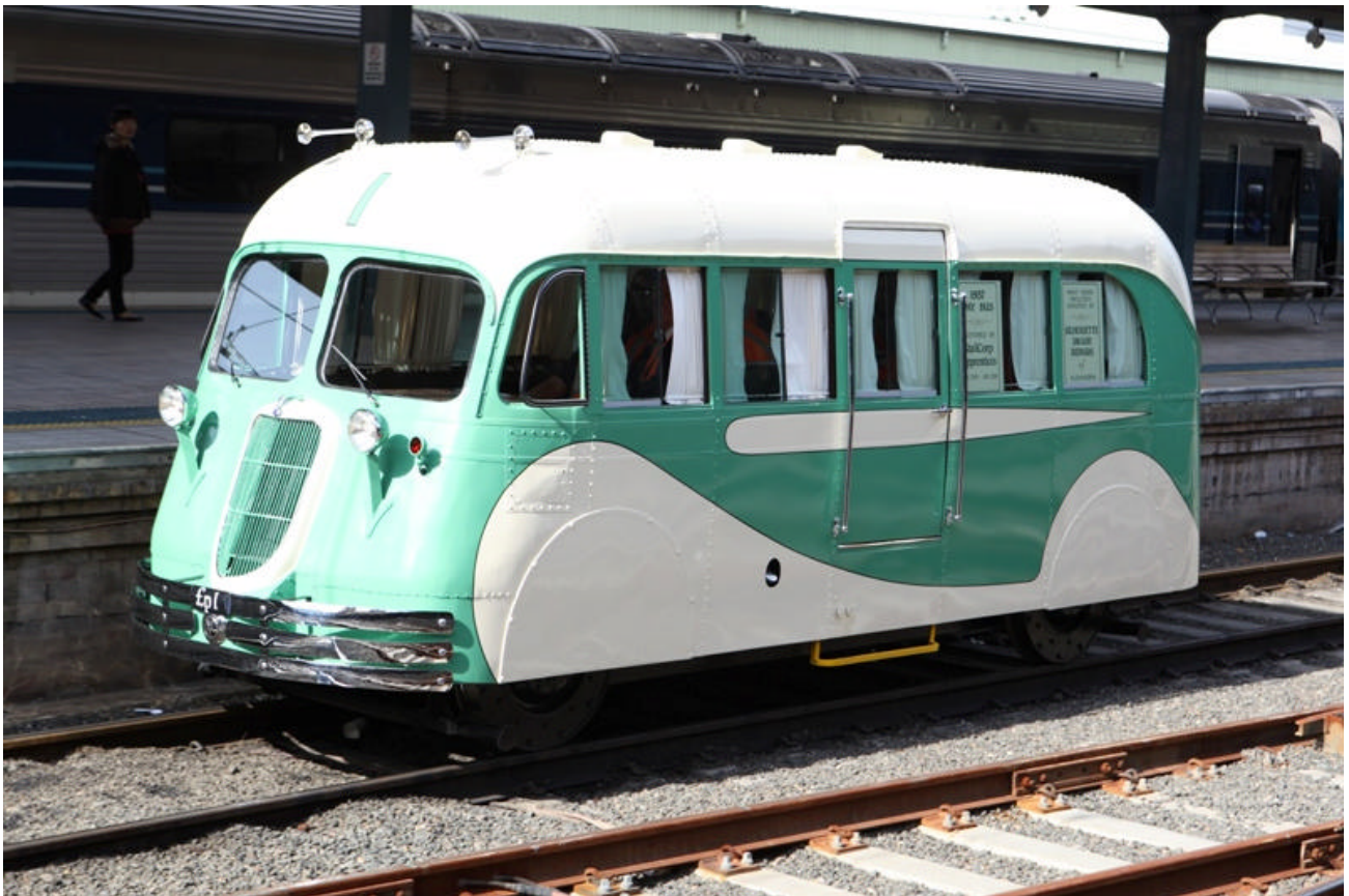
Restored pay bus FP1 arriving at Central Station platform 2 in August 2009 on its handover following the completion of its restoration

Apart from historical interest you might ask what is the link with AMRA ? Our publicity officer Philip Lee was one of the last paybus drivers in New South Wales. The photos show the restored paybus at Central and on the next page show Philip alongside the restored FP1 and a somewhat younger Philip at the controls of a later paybus.