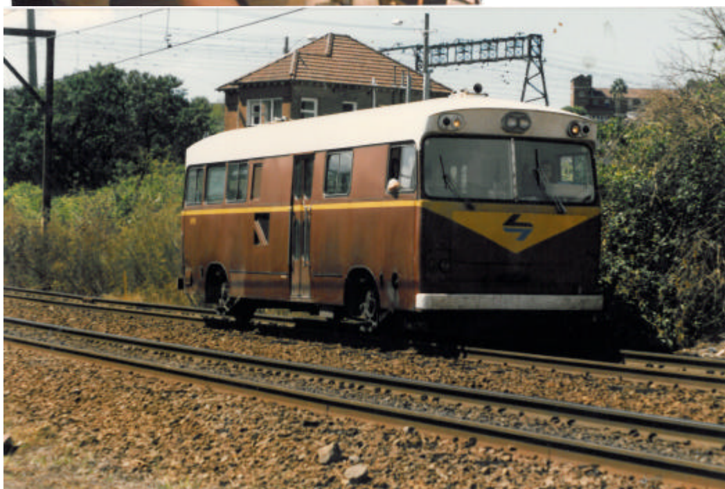
Rail Pay bus FP12 at Mungo Scott's siding at Lewisham in 1985