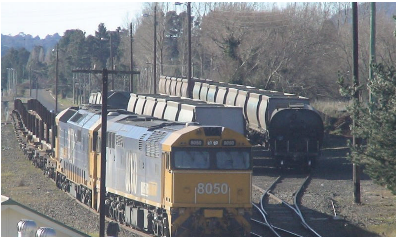
8050 on a rail set train at Moss Vale in July 2009

AMRA recently purchased some emergency fluorescent lights and these will be installed soon to provide better illumination in the event of a blackout. Recently Glenn Percival arrive on a Monday afternoon to find the water heater had sprung a leak with water cascading over the work bench onto the floor and finally out the door. This resulted in a number of cardboard boxes and other items in the workshop being damaged and even the carpet in the office getting wet. The heater was manufactured in 1995 and has been in our use since 2002 so we have had a good run for our money. It has now been replaced with a new heater.