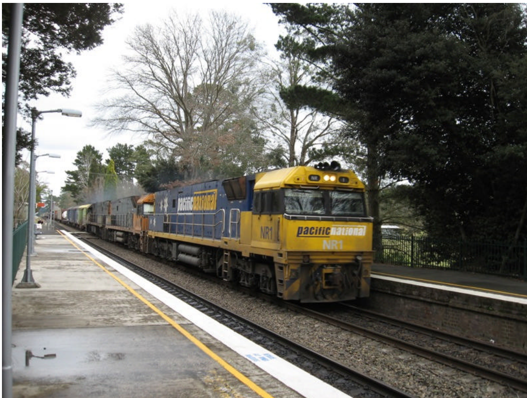
NR1, NR107 and NR48 lead 3PS6 general freight through Burradoo station.