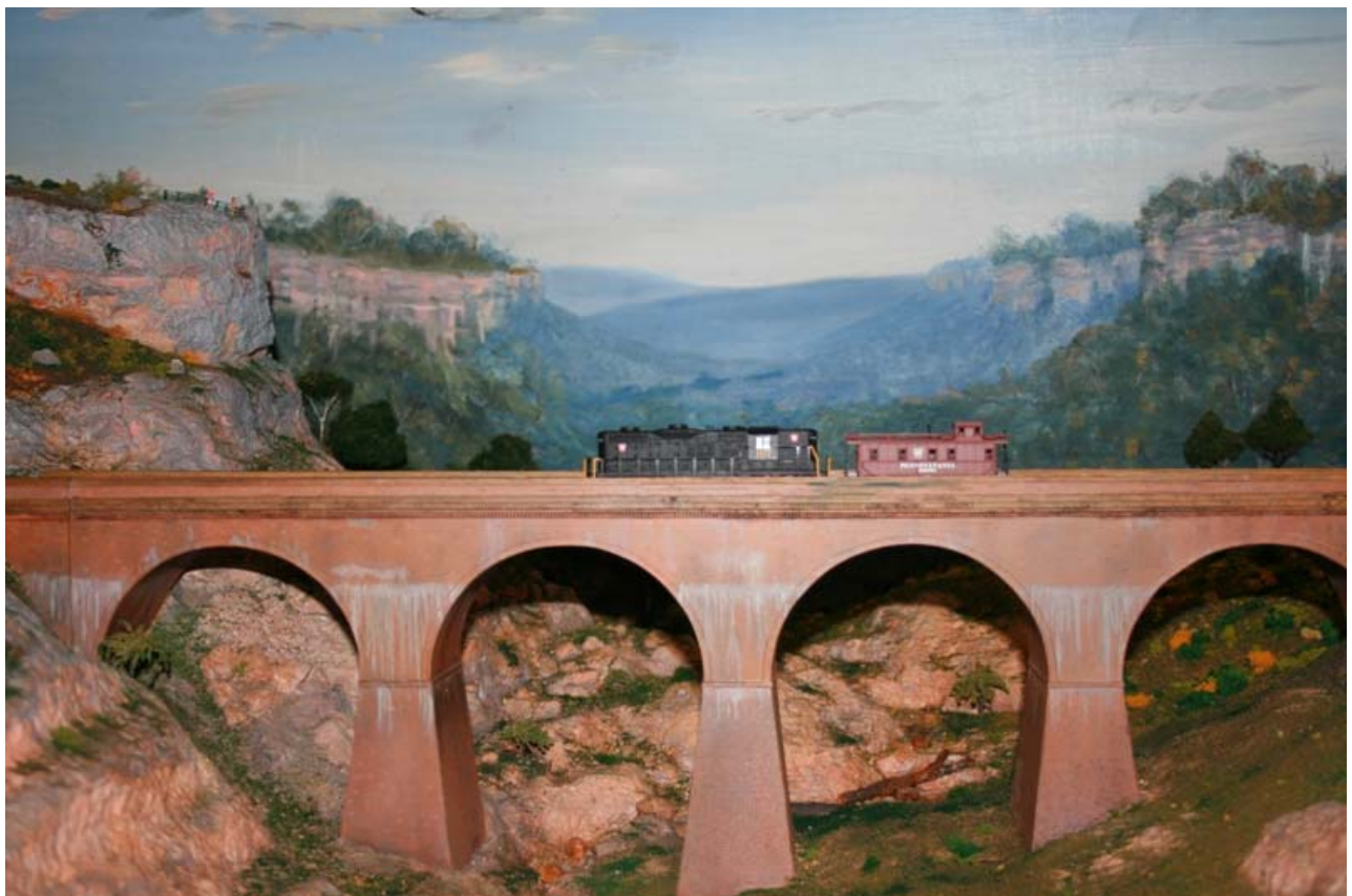
Now when you want a challenge try photographing N Scale. The club's N Scale layout has definitely benefited from Val Bennett's artistic touch.