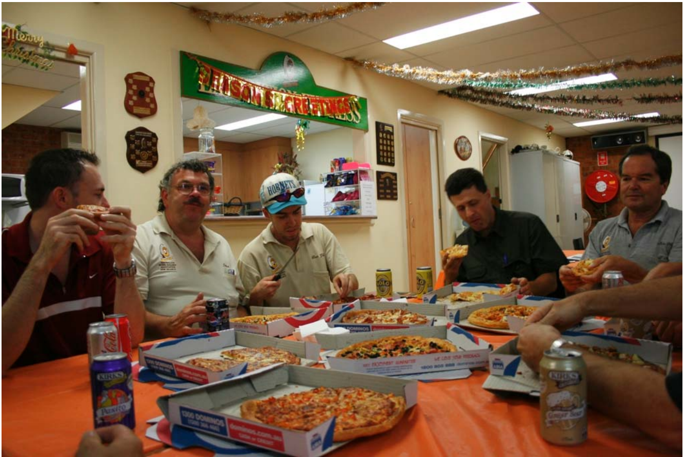
Saturday Night Pizza nights are always popular at the Mortdale club rooms. Some of the members enjoy a feed in early January 2009. Looks like they didn't cut the pizza to Ben's liking.