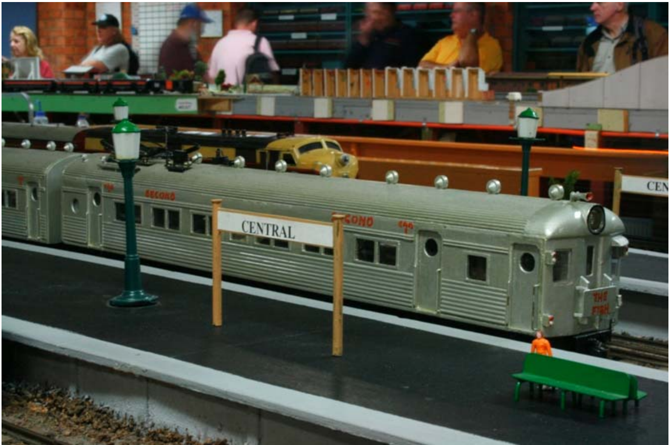
Col Shepherd's U Boat set on the AMRA O Gauge Layout