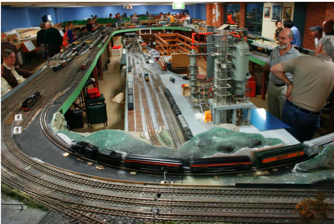
A wide angle view of the O Gauge layout in operation at the April 2008 Open weekend with Ross McLean and Maurrie Haynes are in earnest discussion as the trains flash by.

Cover photo GM22 & 4488 and V Set at Belmore