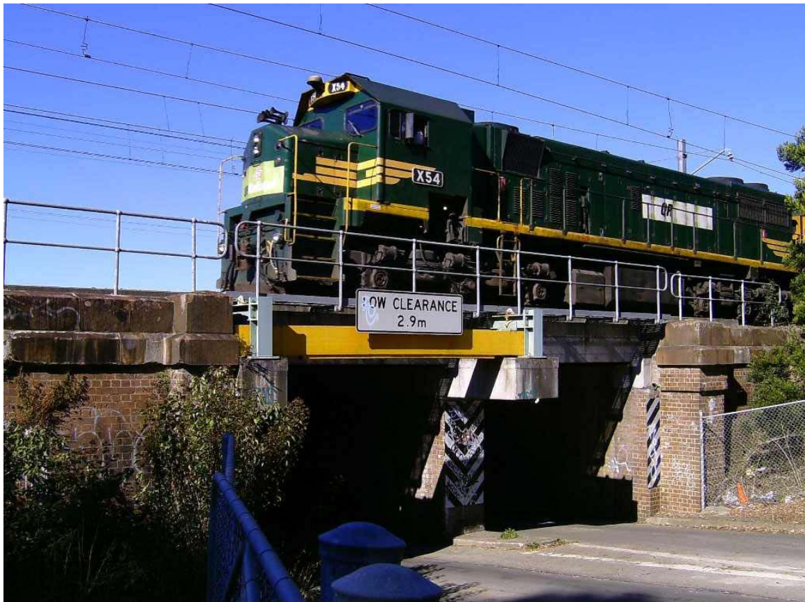
X54 at Hurlstone Park photo now reproduced in colour in lieu of the black and white image published in the November December AMRA Journal