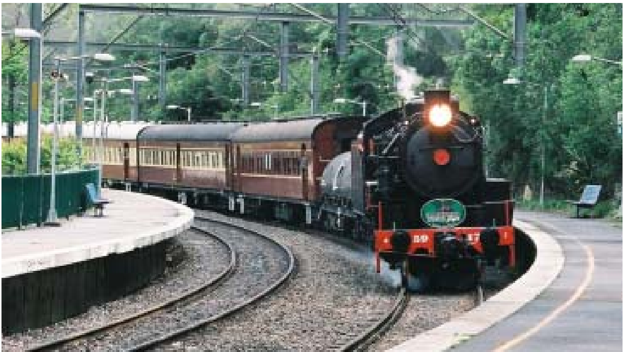
5917 passes through Otford on one of the Cockatoo runs that it did in early December 2008