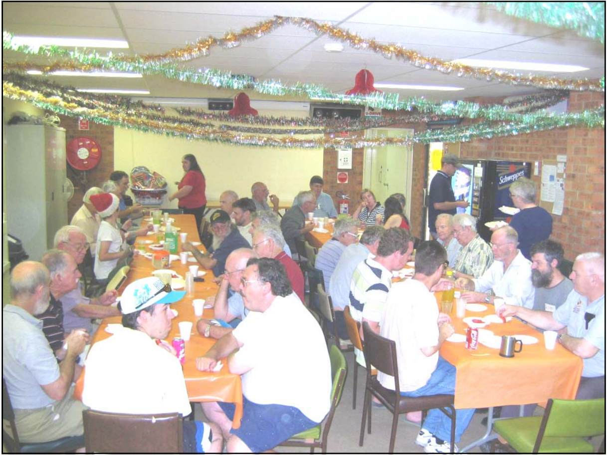
AMRA Members enjoy a Christmas afternoon tea on Saturday 15th December which was kindly provided by the Ladies Auxiliary