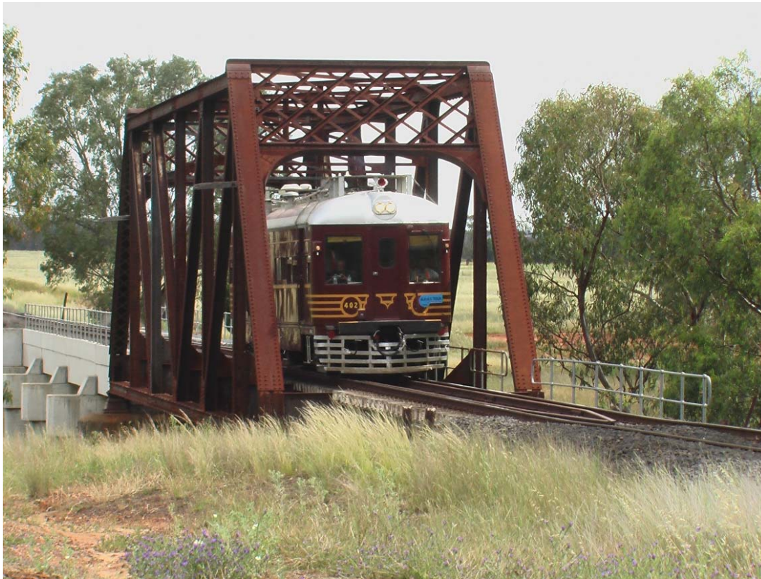
402 crosses the Talbragar River, east of Elong Elong, on the route from Dubbo to Merrygoen thence Binnaway.