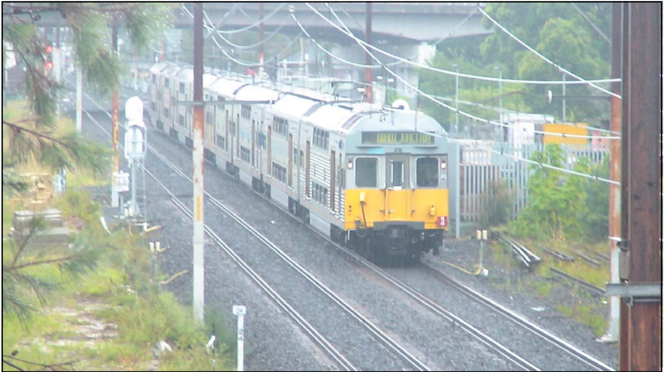
An S set forming a Bondi Junction service accelerates down the hill towards the Como bridge after coming off the Cronulla line at Sutherland. January 19, 2008.