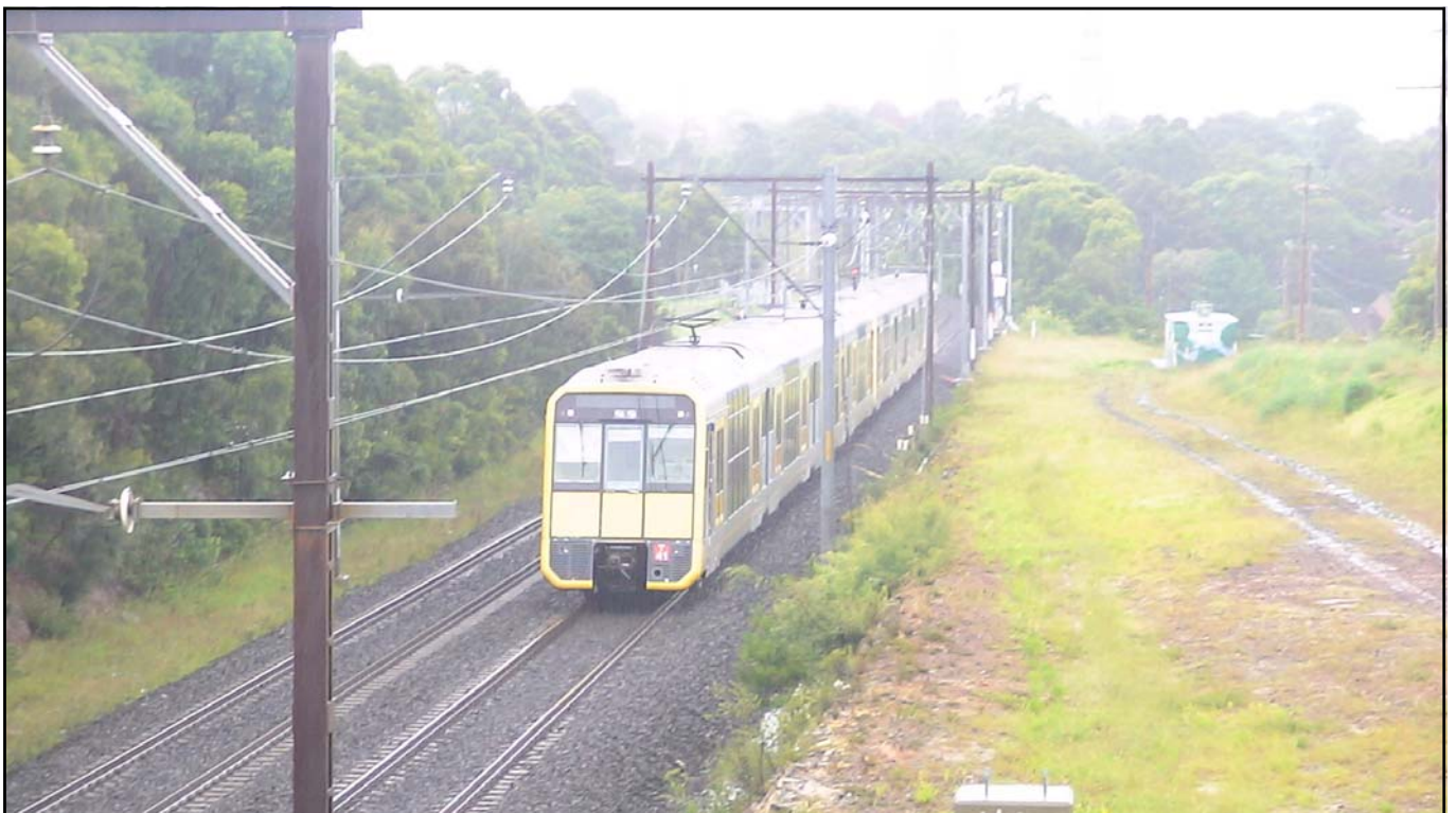
Heading in the opposite direction a few minutes later, a Waterfall bound Tangara powers up the grade on a very wet January 19, 2008.

On the back cover: Canadian Pacific 2816 is serviced beneath some truly awesome scenery in the shadow of the Rocky Mountains in British Columbia during an excursion run in 2005.