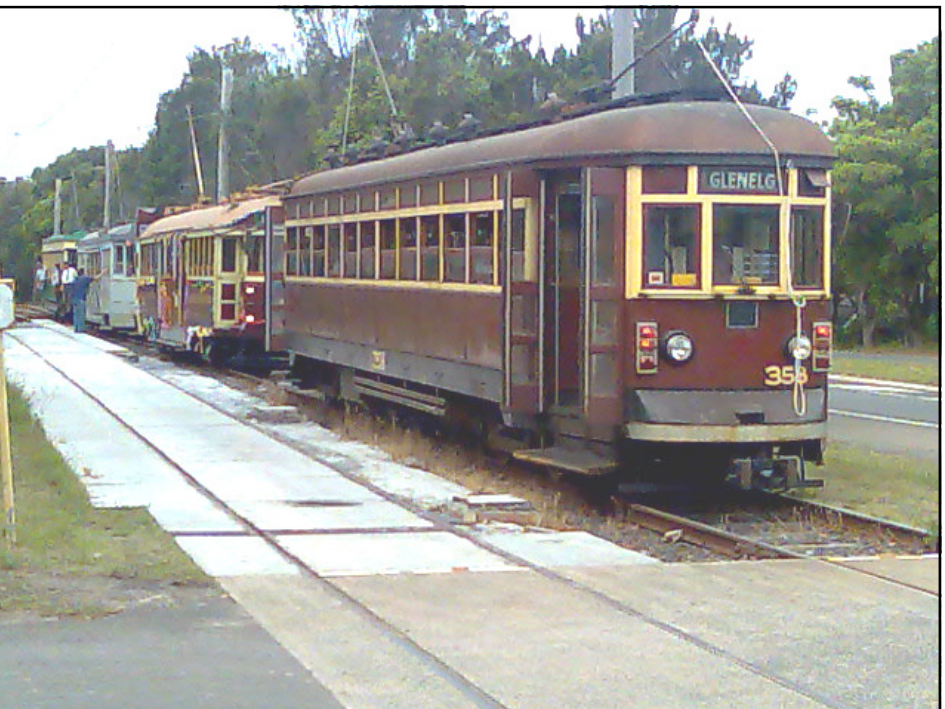
Adelaide H class tram 358, heads a line up of trams from around Australia at the Sydney Tramway Museum at Loftus. December 1, 2007.