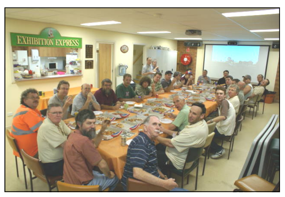
After the pack up from the 2007 exhibition and subsequent unpacking back the clubrooms a short while later, the weary volunteer workers retired for a well earned feed. 1 October, 2007.