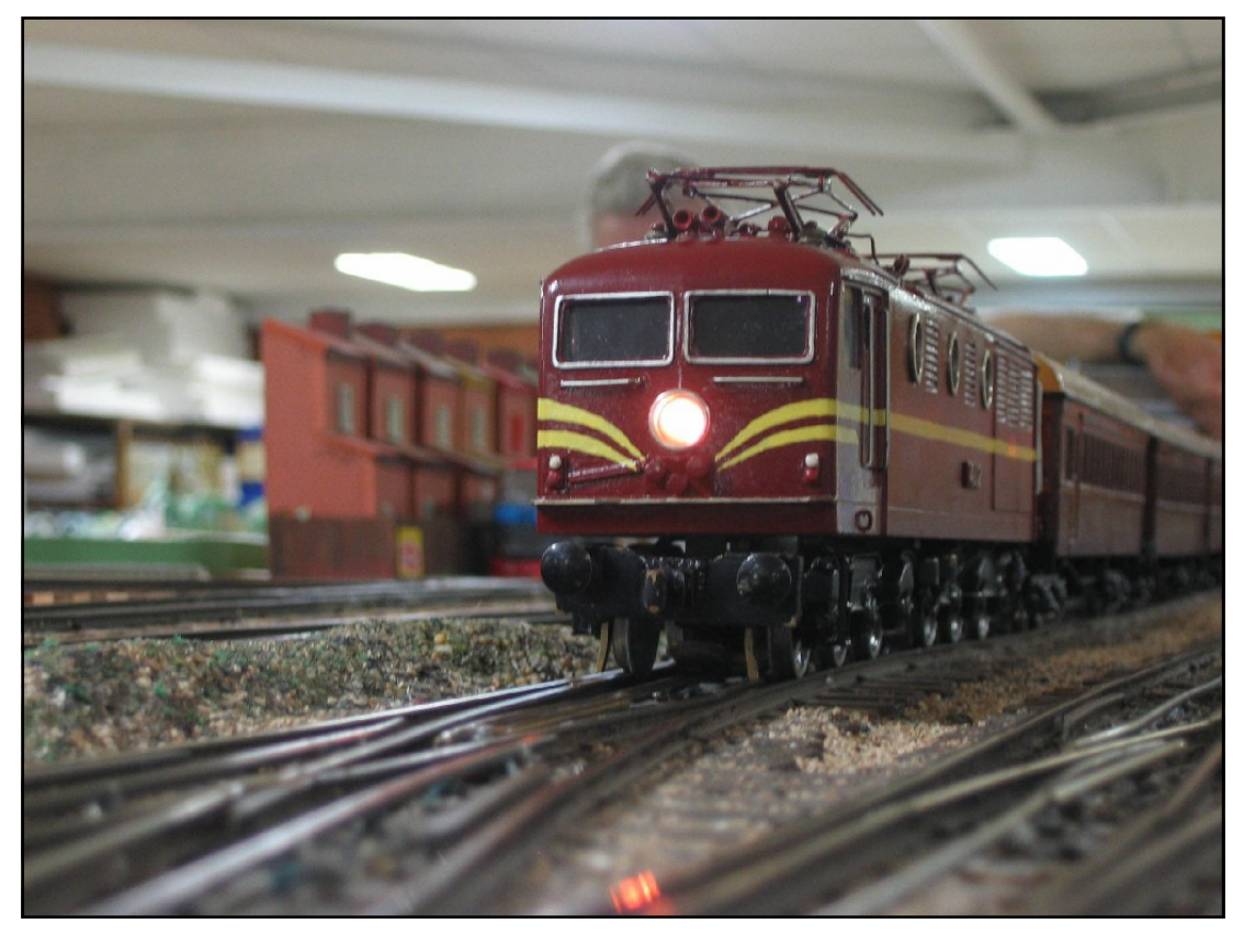
Col Shepherd's 46 class blasts through the crossovers at Central station as it departs for another trip around the O scale layout. 28 November, 2007.

Firstly, some comments directed at those members who get the chance to read "Mortdale Matters" but do not make it to the Club very often. You will hopefully be interested in why the stately, venerable gentlemen that hang around the "O" layout are adding more track.