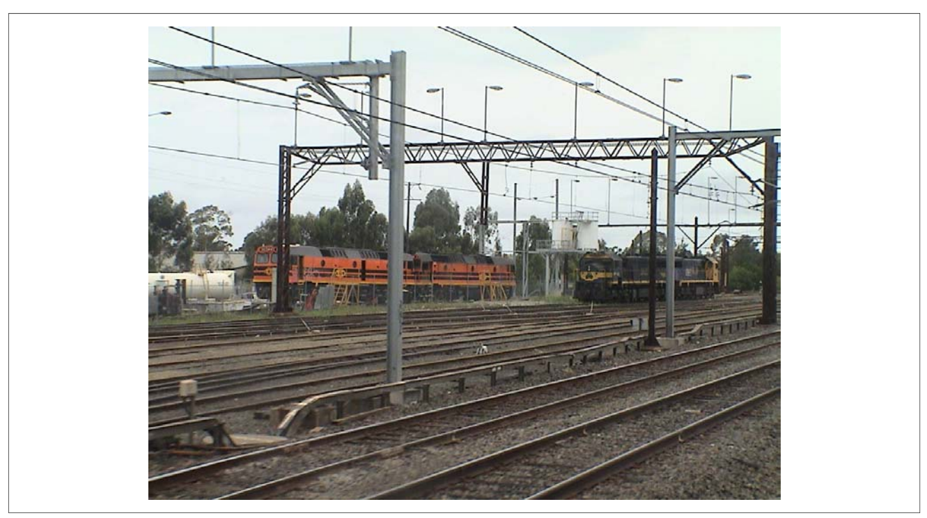
22 Class (formerly 422 class) and X class locos rest at Clyde. December 2nd, 2006.

On the back cover: Members pose in front of 4 wheel tram No.29 during the Christmas and Exhibition Workers BBQ at the Sydney Tramway Museum, Loftus. December 2nd, 2006.