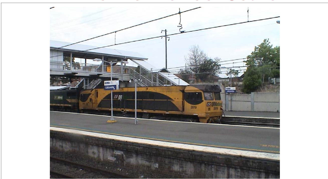
QR National 2819 leads a freight train through Lidcombe towards Port Botany. December 2nd, 2006.