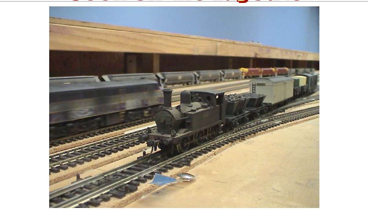
An 18 class prepares to leave Read yard while 44 class "Priscilla" speeds past on the Down Main. December 16, 2006.