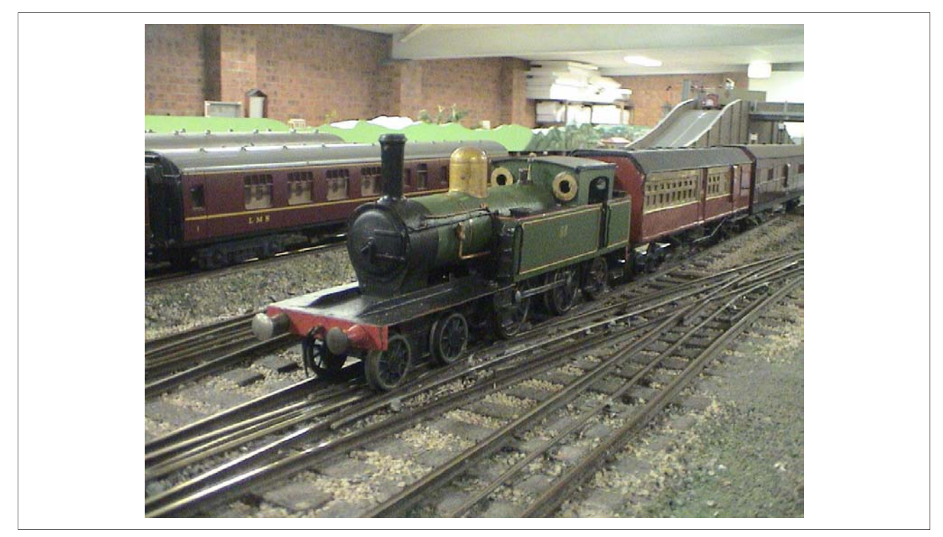
Rarely modeled in any scale, a NSWGR 11 class 4-4-2 tank departs Central with a short train on the O scale layout. December 16, 2006.