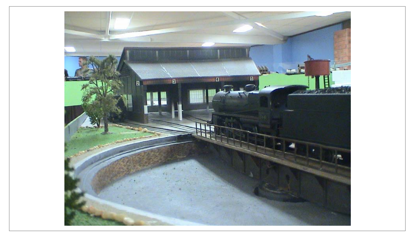
Belpaire boilered 36 class, 3641, is turned on the turntable at Pageton after arriving with a goods train. This area is yet another example of Neil Sorensen's scenic work. December 16, 2006.

The layout's popularity is continuing to increase with an ever growing number of people interested in operating the layout and getting into O scale.