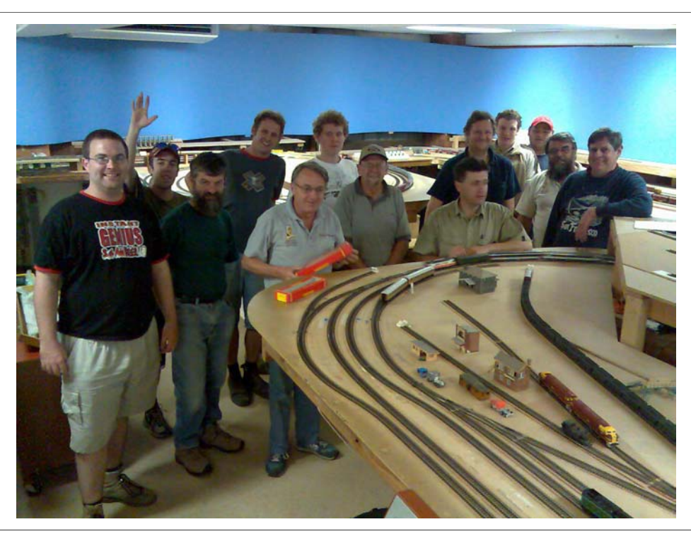
Midnight during the first 24 hour running session. 13 members are still running and looking reasonably awake! By morning the trains were still running but the operators were looking decidedly worse for wear. November 12, 2006 (Just).