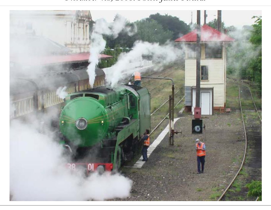
Returning from the second Silver Star trip to Cobar. Freshly repainted 3801 takes on water at Moss Vale. November 7th, 2006.