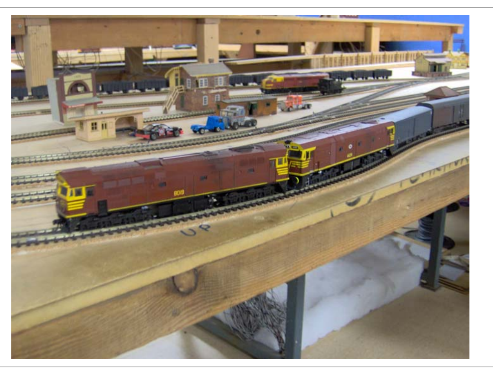
8019 and 44214 prepare to leave Yerriyong (Up Yard) at the start of the first Australian Diesel running session during the 24 hour run on the HO layout. November 11, 2006.

As always the layout continues to run well and a large number of both trains and operators can be seen on most running days.