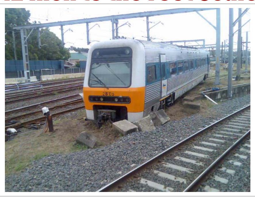
A brake failure put Endeavour power car 2805 in the dirt at Eveleigh. The Up Eastern suburbs line is in the foreground while the Down Illawarra mainline is directly behind the Endeavour. November 4th, 2006.