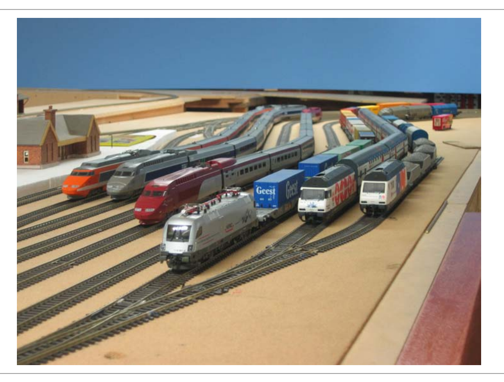
Fayenton Yard on the HO Layout during the second of two European prototype running sessions during the 24 hour run between 10pm and midnight. November 11, 2006.

By 10am though everyone was showing just how tired they were. Trains were packed up and the building vacated in record time! All in all though a highly enjoyable weekend.