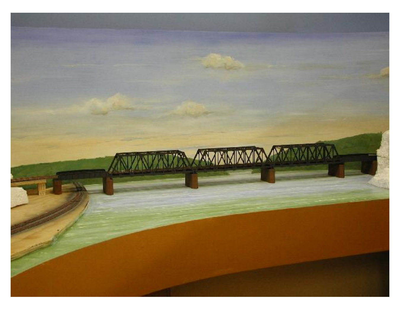
The New Truss Bridge on the N scale layout with Lanham Wharf visible on the left.