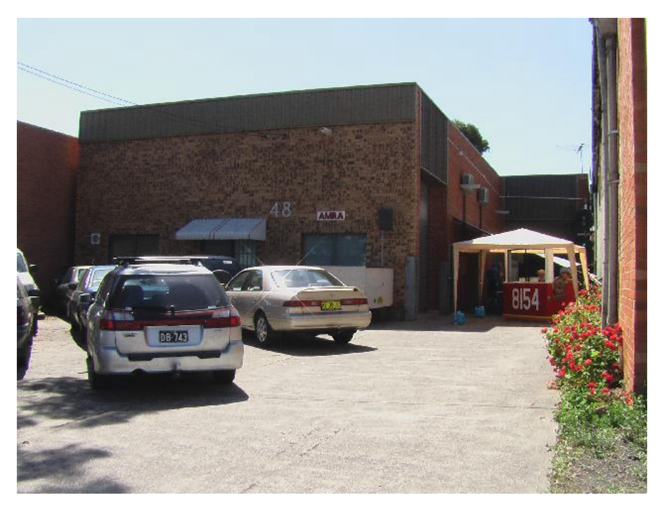
The Mortdale clubrooms during our October Open Day – Oct 14<sup>th</sup> 2006.